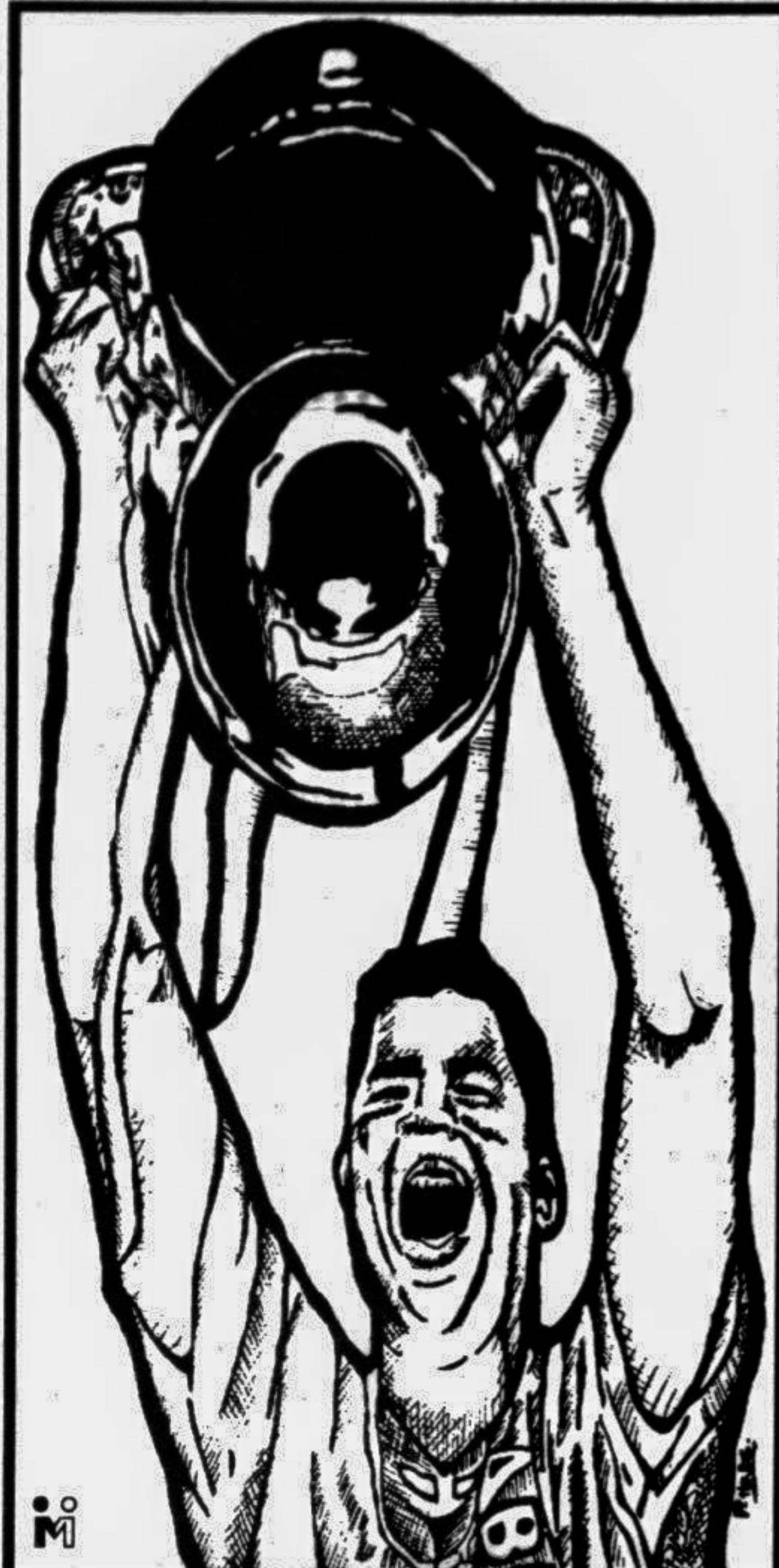
Star striker Patrick Kluyvert holds aloft the European Cup in 1995: Now Ajax may lose him without a fee

The proportion of Singapore's population aged 65 and above will double to 14 per cent in 24 years, Goh said, explaining that "sports for life" was designed to enhance the quality of life in an ageing society.