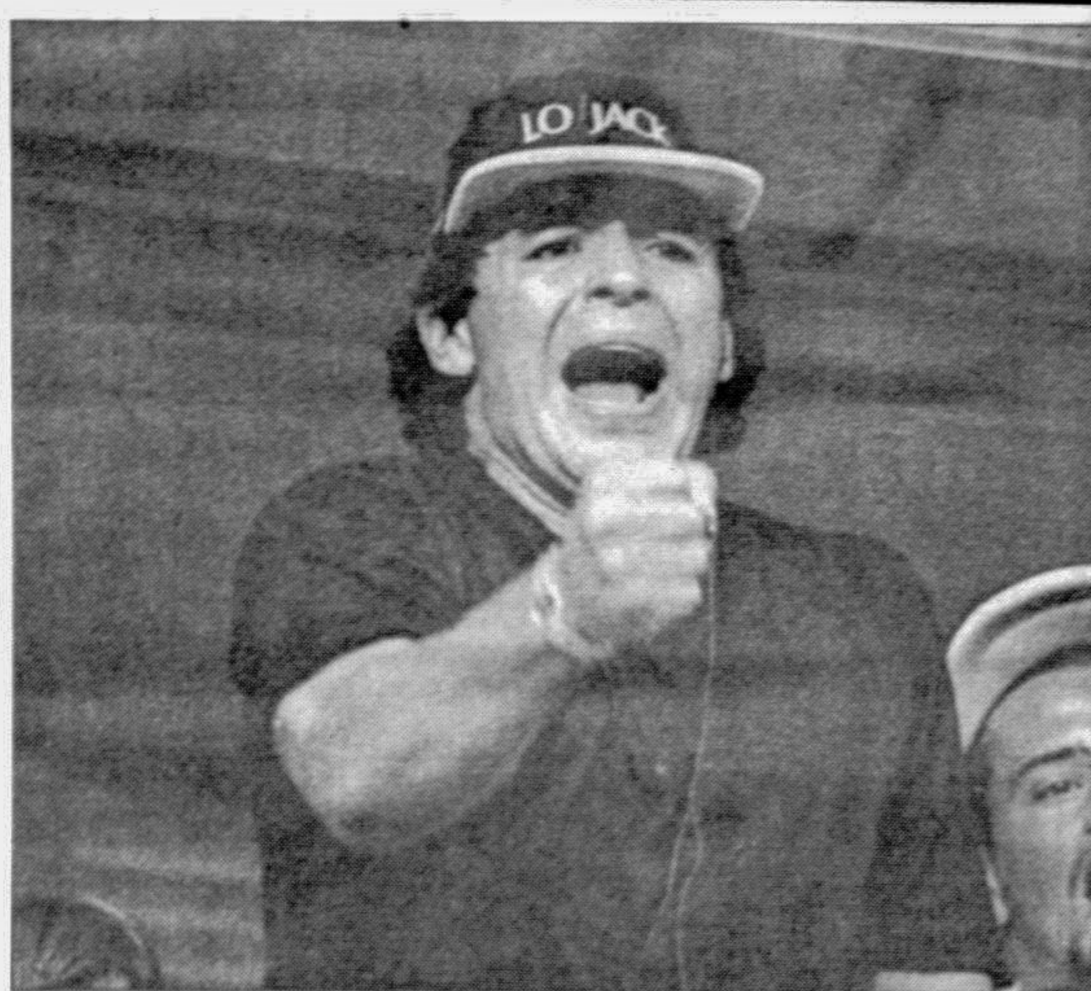
Volatile Argentine soccer superstar cheering up his team Boca Juniors from the stand during a match against River Plate in Buenos Aires on September 29.

BEIJING, Sept 30: League leader, Dalian Wanda drew with hosts, Beijing Guoan on Sunday to retain their place at the top of the Chinese professional soccer league, the Xinhua news agency said, reports Reuter.