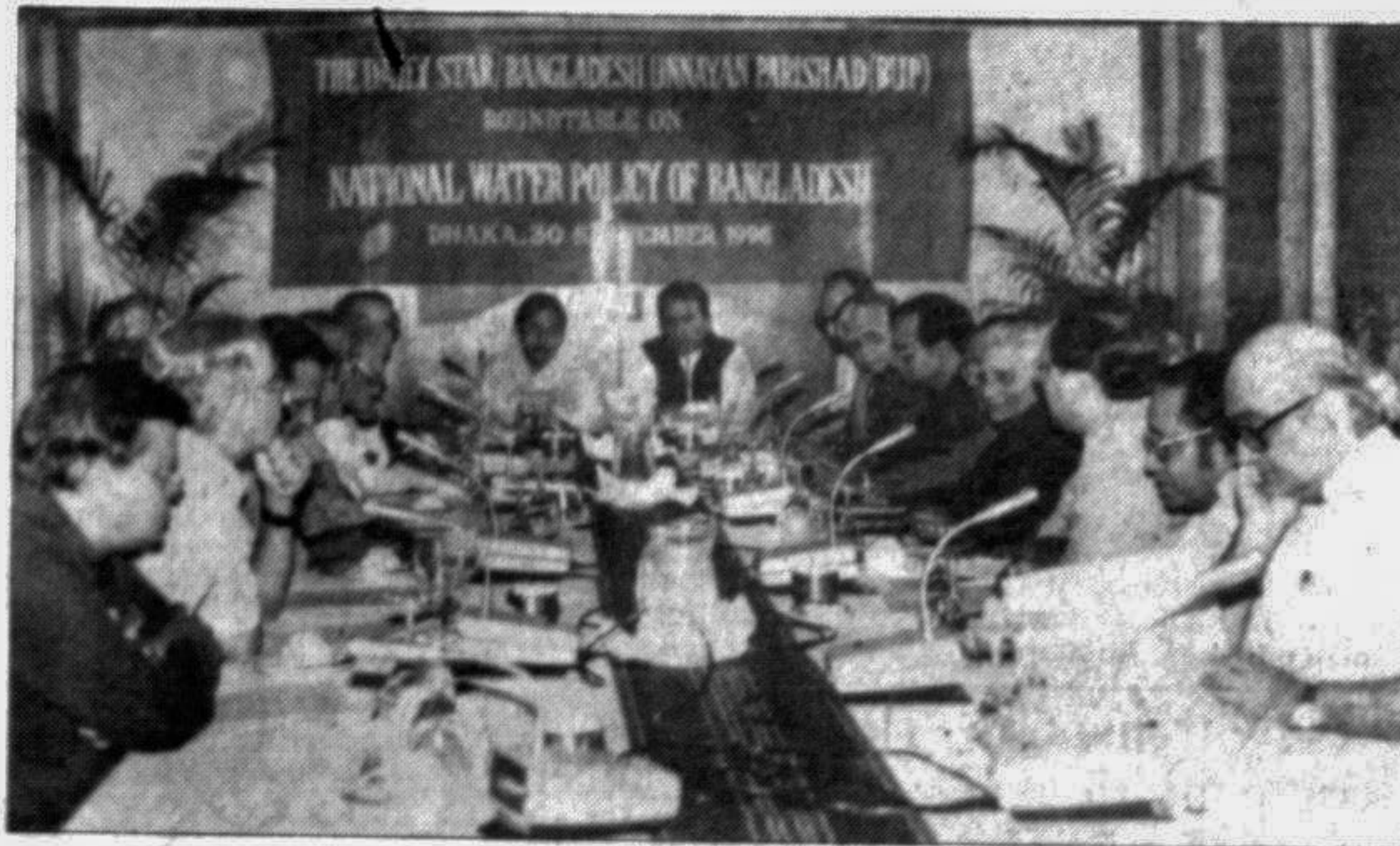
The Daily Star and Bangladesh Unnayan Parishad jointly organised a round-table on National Water Policy of Bangladesh at a city hotel yesterday.