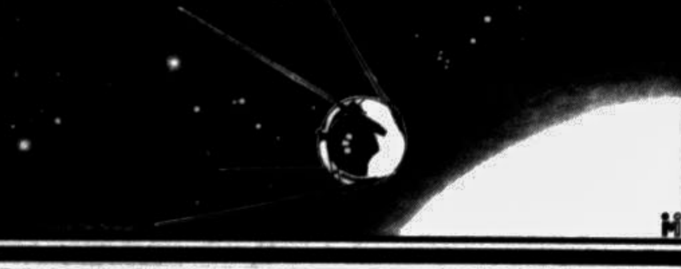
In the month of February,