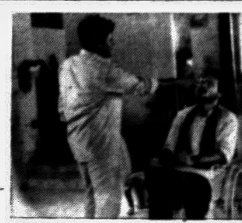
Kurukshetra on Zee TV today at 3.00 pm

6:00 BBC Newsroom inc. World Business Report/Asia Today/24 Hours 9:00 BBC World Headlines 9:05 The Money Programme 10:00 BBC Newsday 1:00 pm BBC World News 1:15 The Money Programme 2:00 BBC World News 2:30 Time Out: Fat Man in France 4:00 BBC Newsday 6:00 BBC News Headlines 6:05 Correspondent 7:00 BBC World News 7:15 World Business Report 7:30 BBC Newshour Asia & Pacific 8:30 Time Out: One Foot in The Past 9:00 BBC World News 9:15 The Money Programme 10:00 BBC World News 10:30 Time Out: Tomorrow's World 11:00 The World Today 11:00 BBC World Headlines 1:05 The Money Programme 1:50 Building Sights 2:00 BBC World News 2:30 Time Out: The Travel Show 3:00 BBC World Report inc. World Business Report/24 Hours 5:00 BBC World News 5:10 Newswright