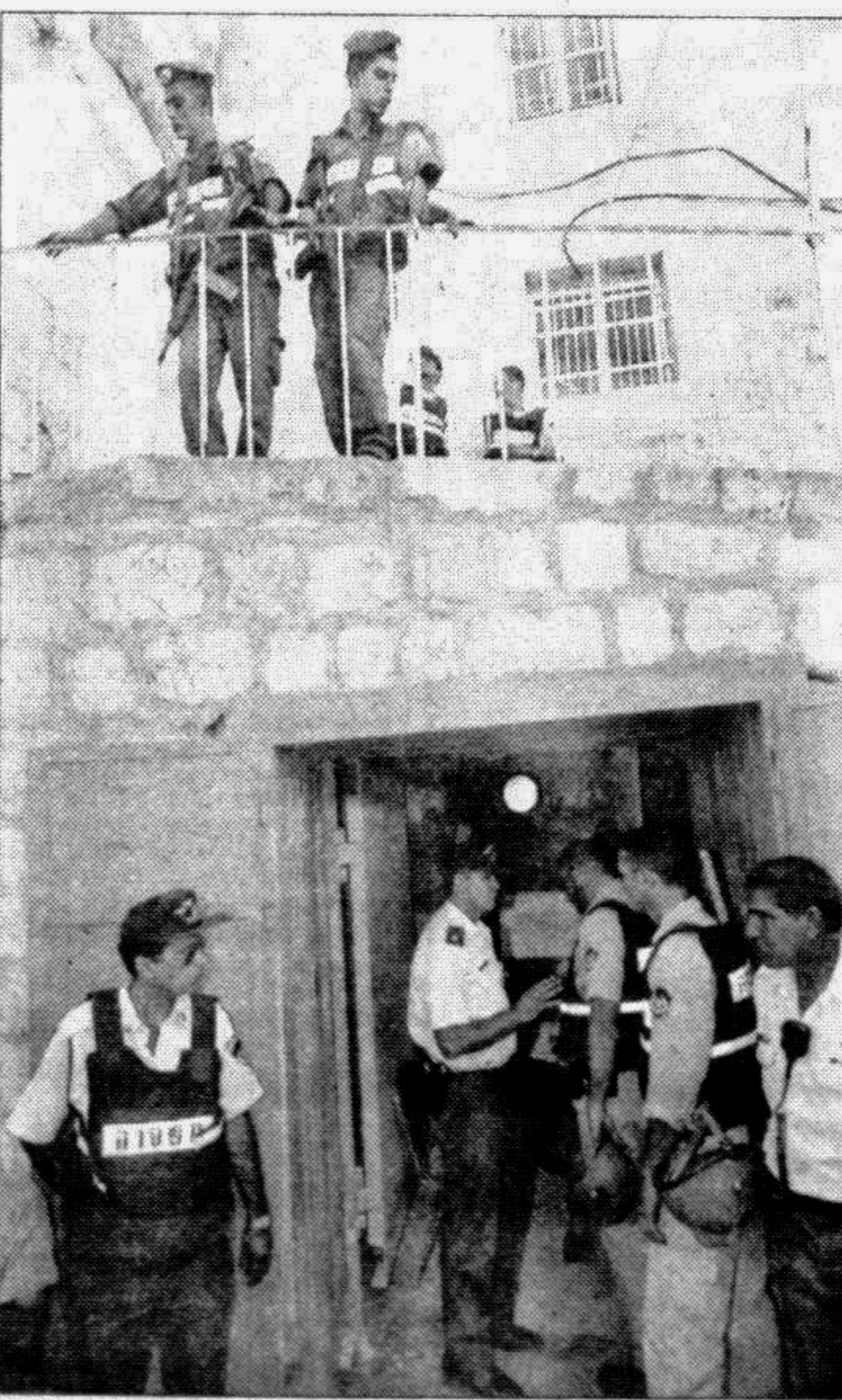
Israeli security forces take position at the exit of the tunnel on the first day of its opening for tourists yesterday in Jerusalem near the Al-Aqsa Mosque compound.

JERUSALEM, Sept 29: Hopes for a quick Israel-Palestinian summit to save the peace process faded today as Israel defiantly reopened an archaeological tunnel that sparked the worst ever clashes between the two sides and threatened to roll back signed peace agreements, reports AFP.