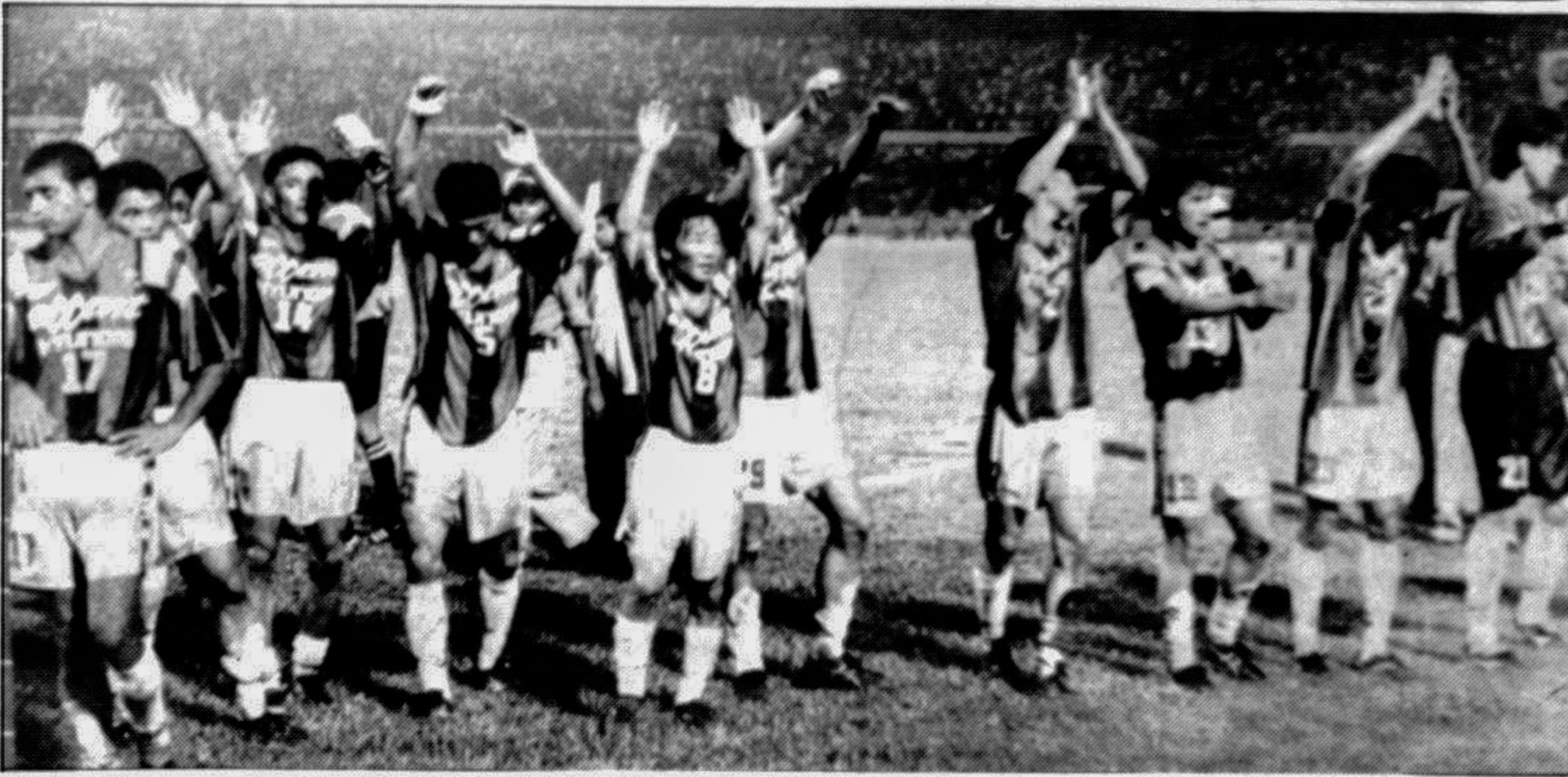
The players of Hyundai Tigers Football Club acknowledge the crowd's applause after defeating Dhaka Mohammedan Sporting Club 3-1 in an Asian Cup Winners' Cup match at the Dhaka Stadium last night.

At this critical juncture of cricket, when there seems to be light at the end of the tunnel, braughty behaviour by player or official, particularly full-time, may be enough to derail our ICC ambitions. The tunnel may then be blocked for eternity.