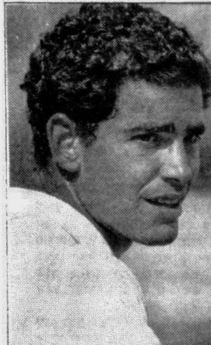
Pete Sampras (US tennis superstar)

"The more I play, the more I want the Slams. It's not the money, it's not the commercials, it's the titles. That's what I'll be remembered for, and I think about that a lot."