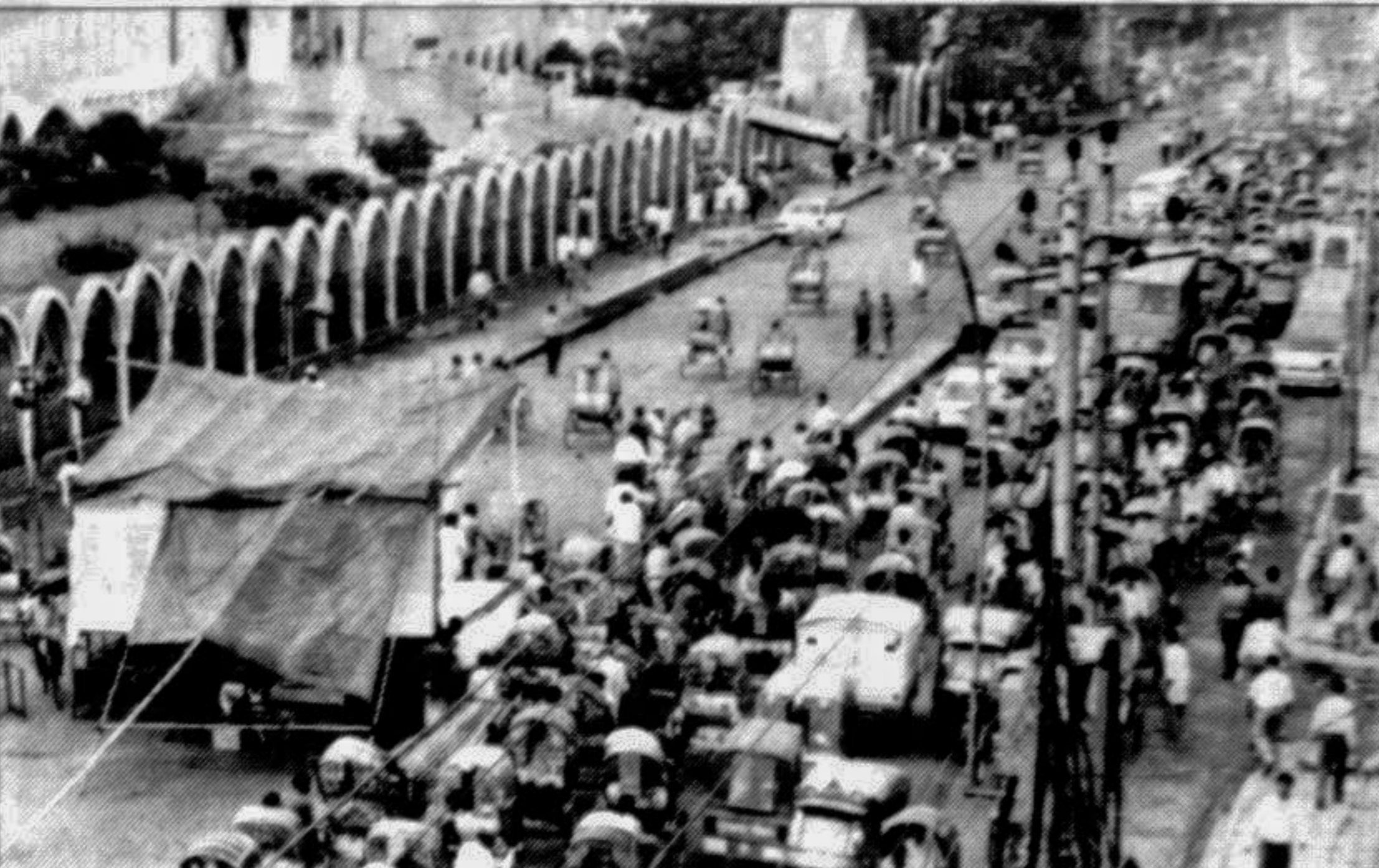
Flow of traffic was seriously hampered at the North Gate of Baitul Mukarram Mosque during a rally of the Islami Shashontantro Andolon yesterday.