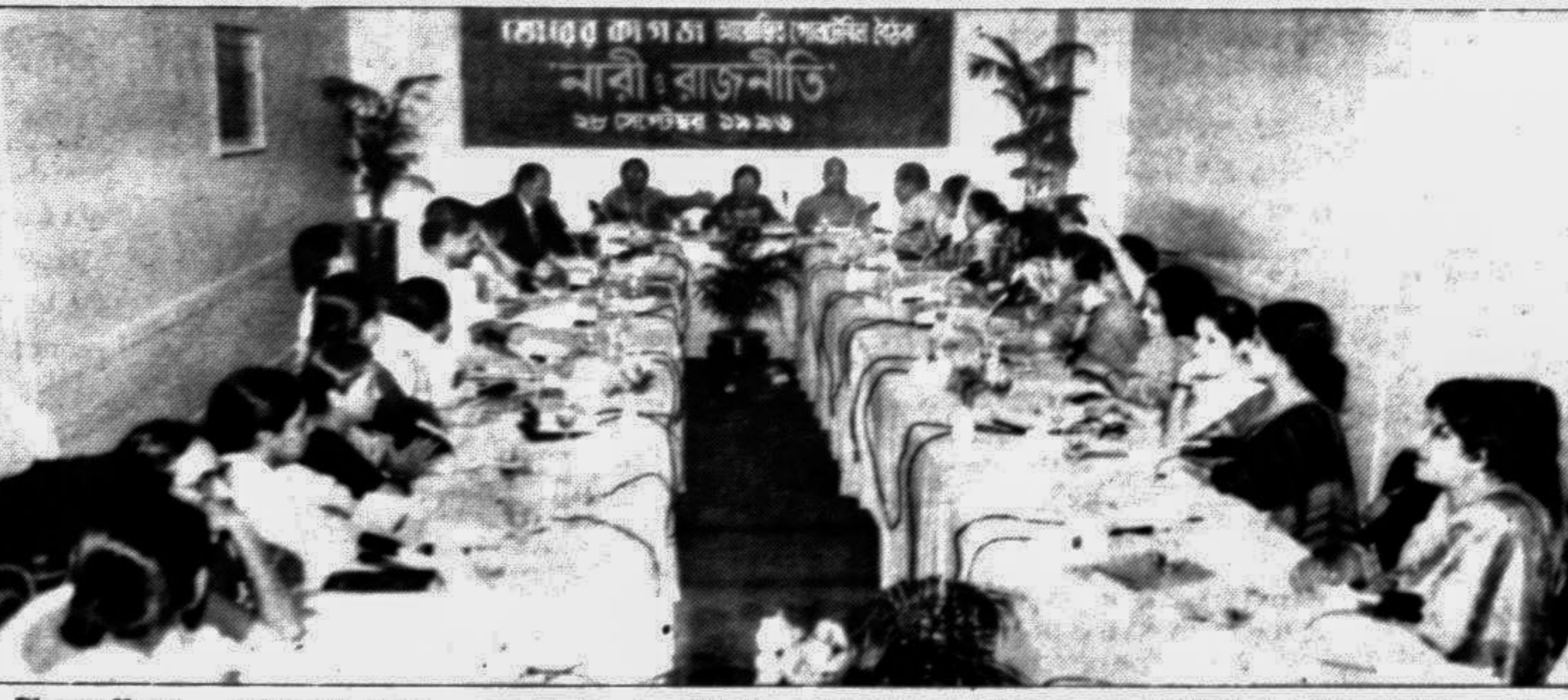
Bhorer Kagoj — a Bengali daily — organised a round-table conference on 'Woman and Politics' at a city hotel yesterday.