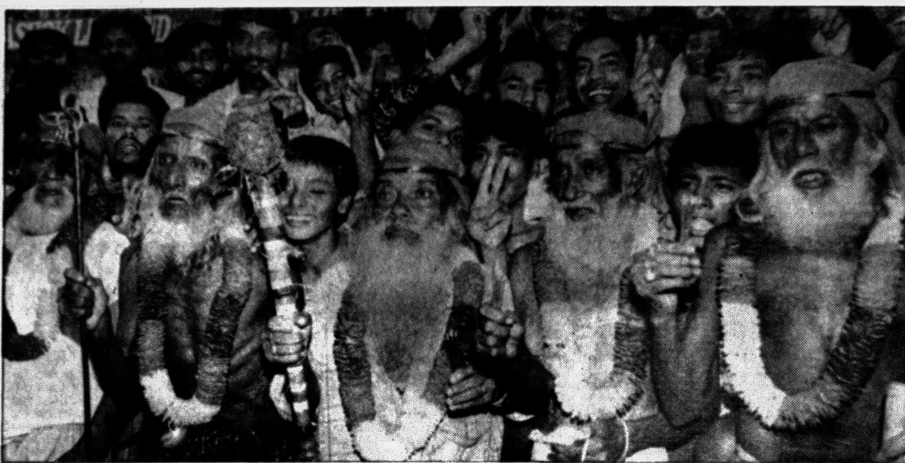
SOCCER SORCERY! A section of ardent Mohammedan supporters solicited the evil spirits of five sorcerers to spoil their arch-rival Abahani's chances to win against Fakirerpool Youngmen's Club at the Dhaka Stadium last evening. But the fakirs wizardry went in vain as Abahani ran away with a 2-0 win.