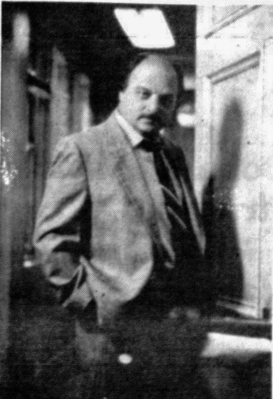
Nypd Blue on Star Plus, Tonight at 9:30

First Day First Show 3:00 Palmolive Extra Time Pass 4:00 Planet Ruby 4:30 By Demand VJ Trei 5:30 Rewind VJ Sophiya 6:30 Big Bang VJ Alessandra 8:00 Planet Ruby 9:00 The Vibe 9:30 Sansui Mangla Hoi 10:00 First Show 10:30 Soul Curry 11:00 House Of Noise VJ Luke 12:00mm Big Bang VJ Alessandra 1:00 Haysah 2:00 By Demand VJ Trei 3:00 Big Bang VJ Alessandra 4:30 V Spot 5:30 Speak Easy