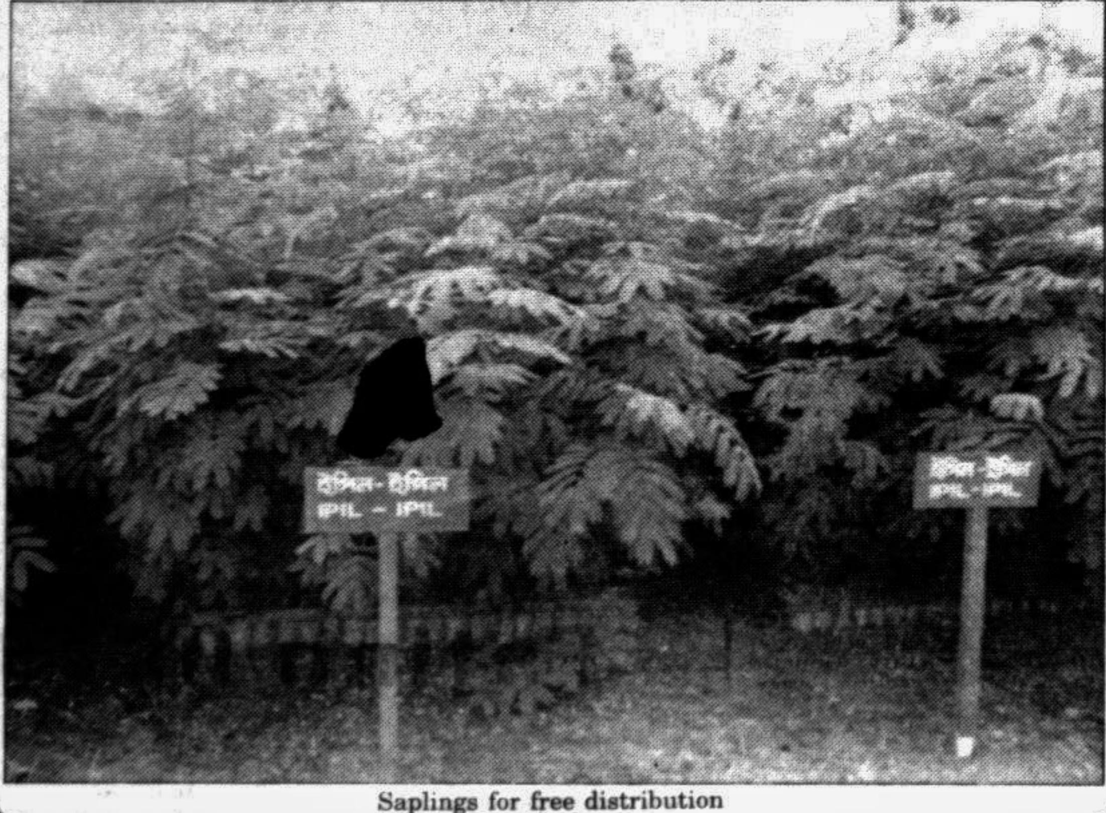
Saplings for free distribution