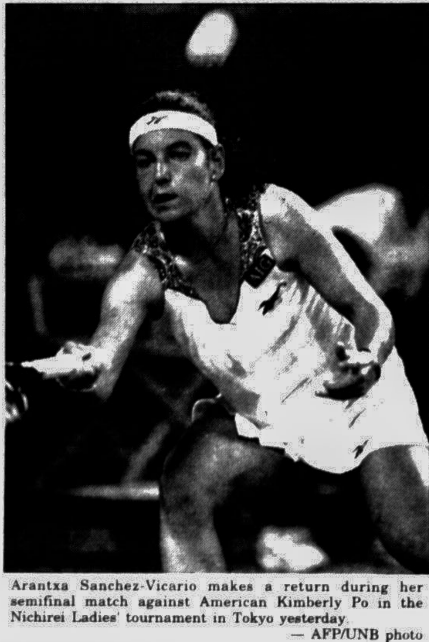
Arantxa Sanchez-Vicario makes a return during her semifinal match against American Kimberly Po in the Nichirei Ladies' tournament in Tokyo yesterday.

On her next serve Date missed a forehand, and Seles then drew level on another backhand error, casting a shadow of gloom over a near sell-out crowd at the Ariake Coliseum. Seles wrapped up the match as Date made successive backhand and forehand errors. "Coming into the match, I knew it would really be tough, because she beat Steffi (Graf of Germany) really well here. I knew she loves this surface," said Seles. "But I still really didn't think she could play a three-set match at that level." Date said: "I knew I couldn't play 100 per cent, I would cope with her at all. I just tried to take rare chances which came by." "Monica played really well today. She hit some deep shots on the important points... it was not my day." It was the fourth straight win for the Yugoslav-American over the Japanese player. Her most recent victory being in the Federation Cup semifinals in Nagoya two months ago. Sunday's final will be the 13th encounter between the current and former world number ones with Seles leading the series 11-1. Sanchez's only win came at the 1992 Canadian Open final.