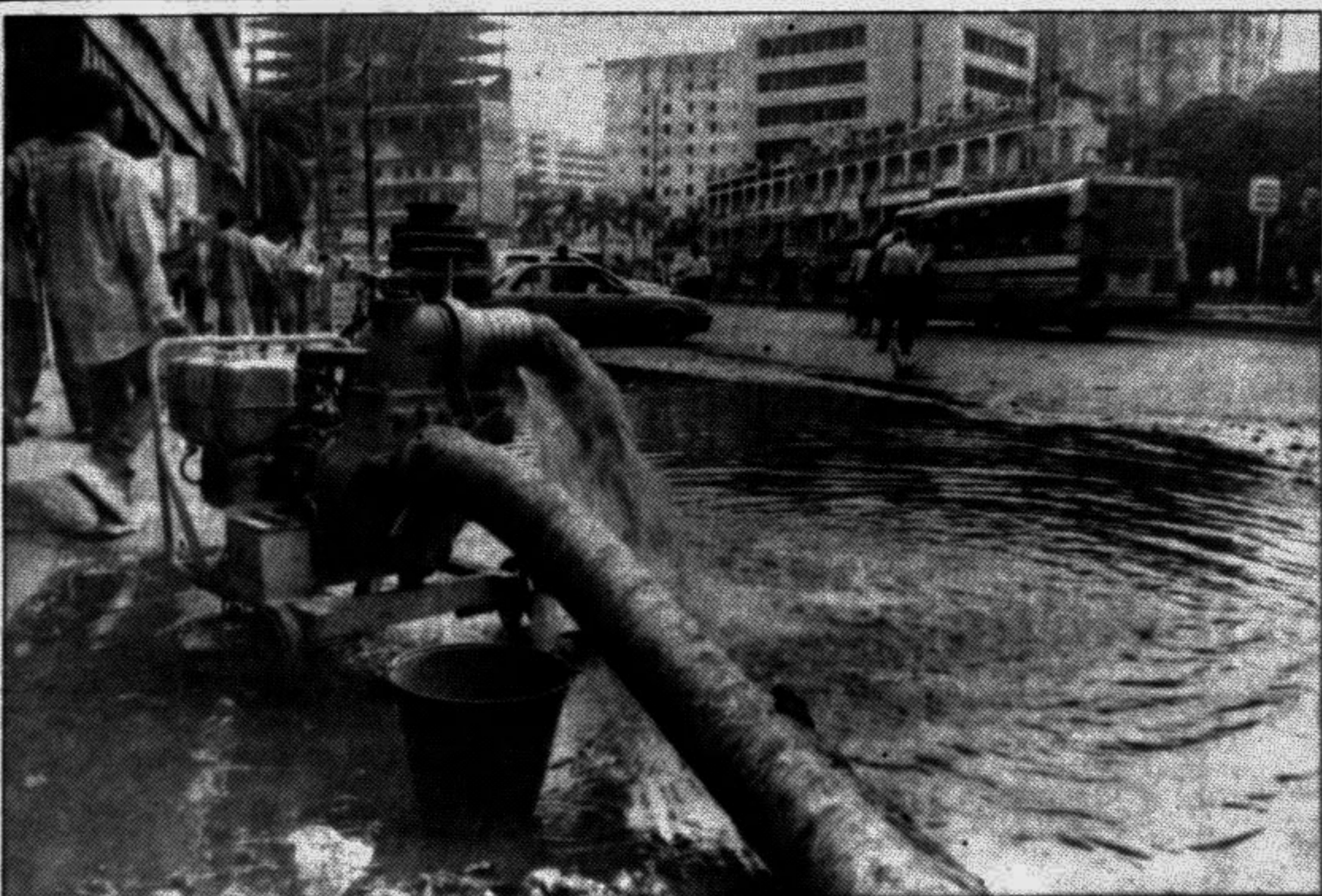
Stagnant water being pumped out at Kakrail in the city yesterday.

The UAE State Minister for Foreign Affairs and other officials met high officials at 10 am yesterday.