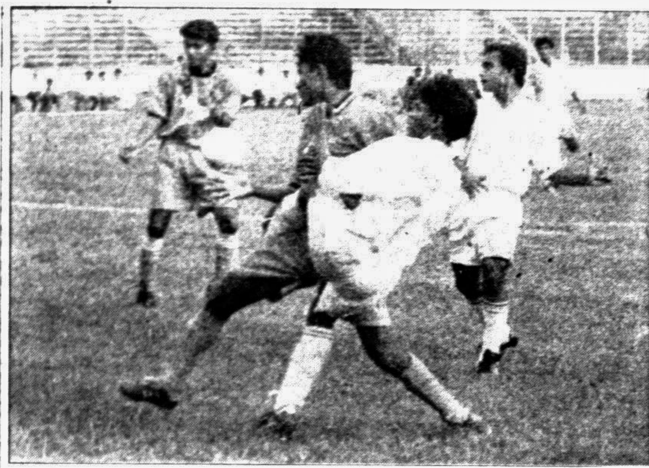
A midfield fiasco from yesterday's Danish Premier football league encounter between Farashganj SC and Brothers Union which the former won 1-0.