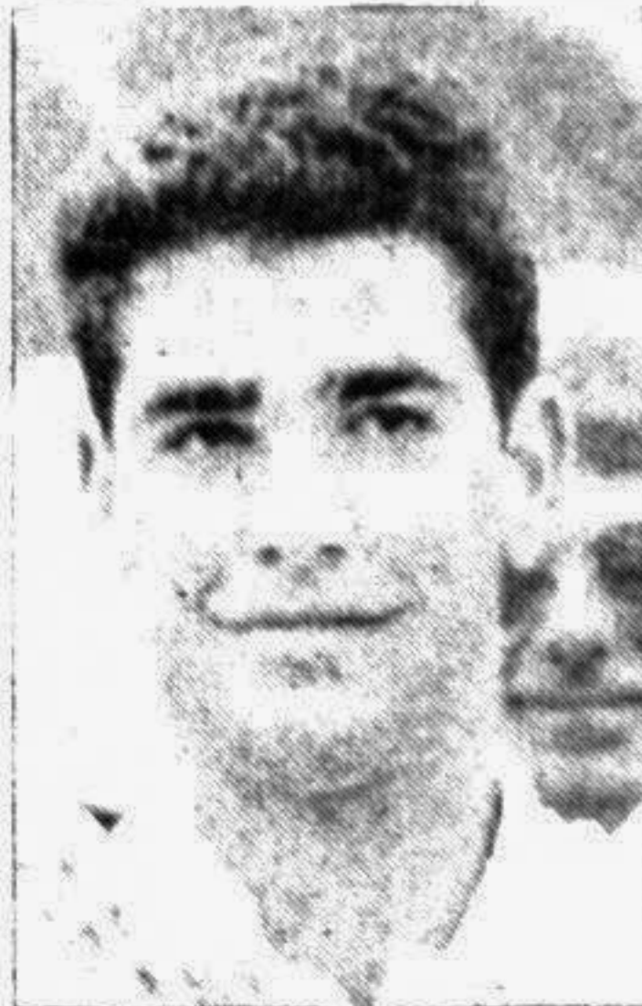
Pete Sampras (US tennis star)

It's just so confusing for everyone to understand how the points work. I just wish there was a race from the beginning of the season to the end to whoever has the most points (at the end) wins. But it's not like that.