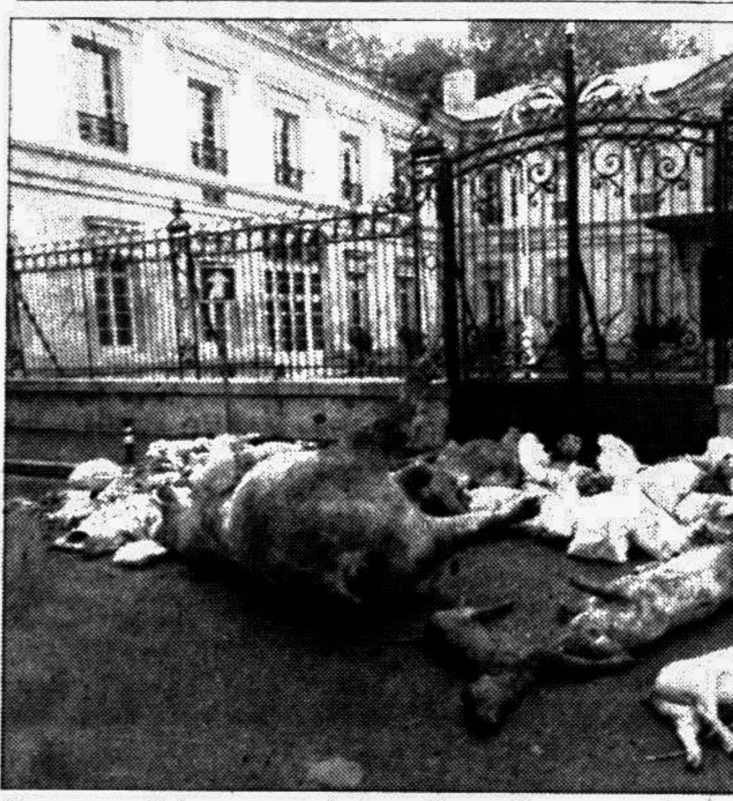
Carcasses of pig, cow and sheep thrown by some 40 farmers lay on a street in front of the Niort prefecture, centre France, on Friday. The farmers were protesting against an allowance they have to pay to bring dead animals to the knackery, a service free of charge before the mad cow crisis.

LONDON, Sept 20: Britain has suspended its cattle cull following new scientific research which questions the value of the mass slaughter programme in eradicating mad cow disease, report agencies. The new scientific evidence now available means that further work is needed on appropriate culling strategies," Prime Minister John Major's Downing St. office said in a statement Thursday night. "For the present, the government is not proceeding with the selective cull but will return to cull options in the light of the developing science," it said. At a European Union farm ministers meeting in Brussels this week, British Agriculture Minister Douglas Hogg cited new Oxford University research which says mad cow disease —