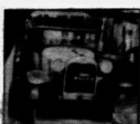
Vintage Cars in City Page 3