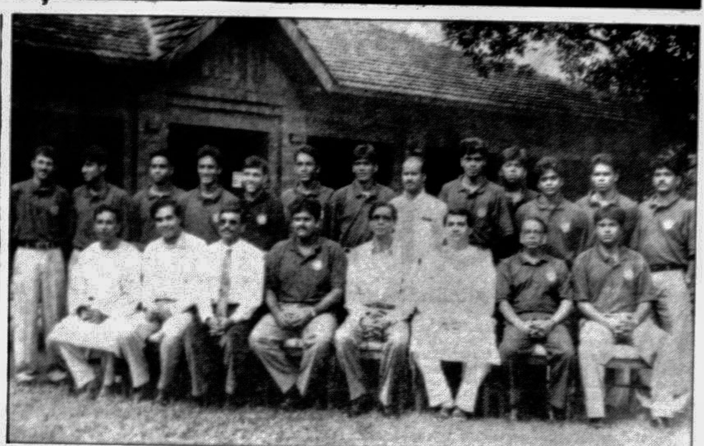
Mohammad Hanif (C), the Mayor of Dhaka, poses with Bangladesh cricket team, the winners of ACC Trophy, at a reception in the capital yesterday.

Danish Premier Division football league: (Venue: Dhaka Stadium) Farashganj SC vs Brothers Union (4 pm) Muktiyodha Sangsad KC vs Bangladesh Boys (6 pm) Danish First Division football league: (Venue: Mirpur Stadium) Wari Club vs Victoria SC (3:30 pm) Police AC vs PWD SC (5:30 pm) Sadharan Bima KS vs BRTC SC (7:30 pm)