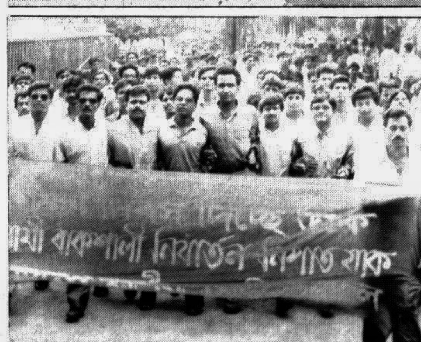
Bangladesh Chhatra League (top) and Jatiyatabadi Chhatra Dal (bottom) brought out separate processions on Dhaka University Campus yesterday marking the historic Education Day.