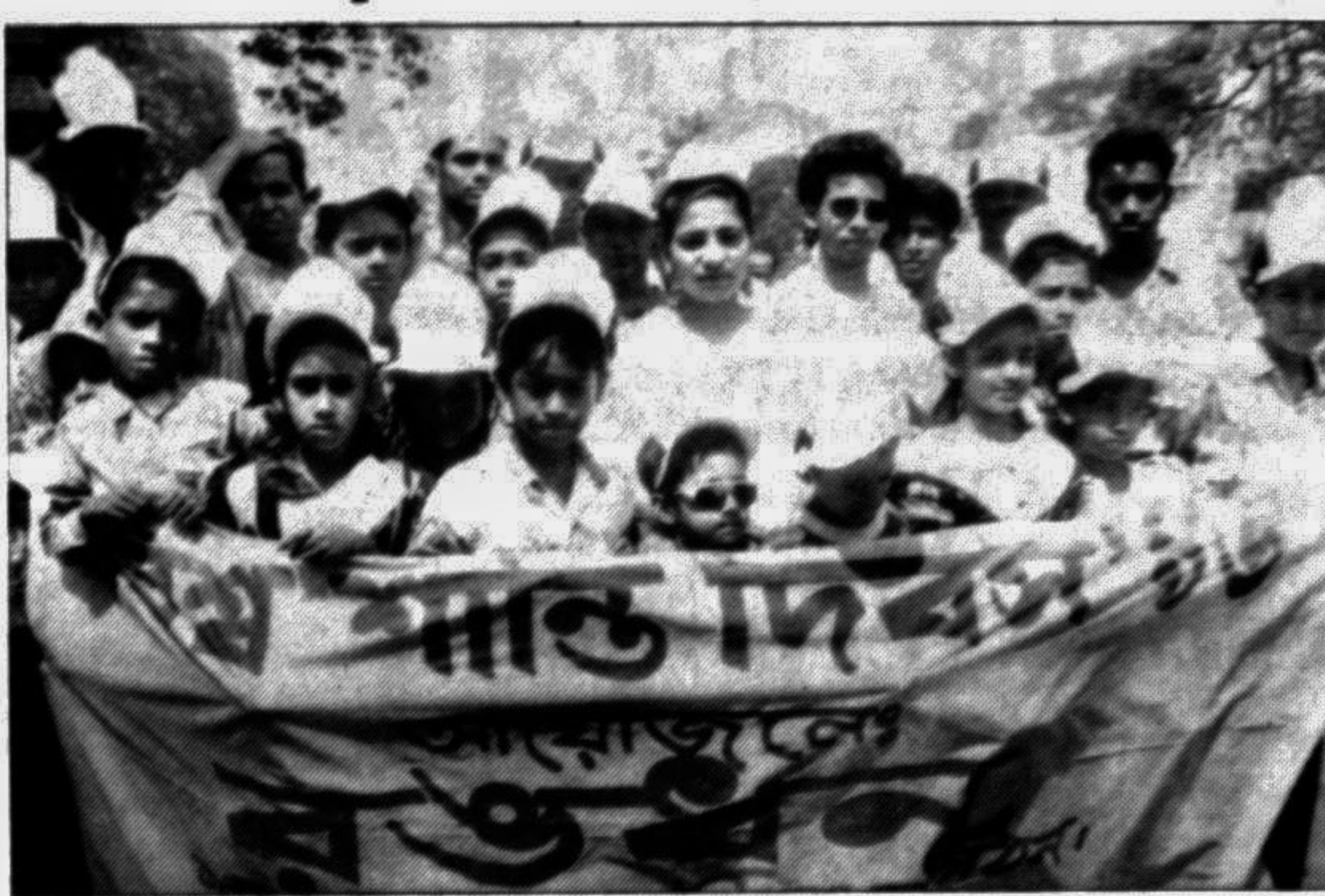
Rangdhanu, a city based socio-cultural organisation, brought out a colourful procession in the city yesterday in observance of the International Day of Peace.

However, the association simultaneously welcomed the government's decision to award selection grade at higher scale to officers in the sixth grade in different cadres.