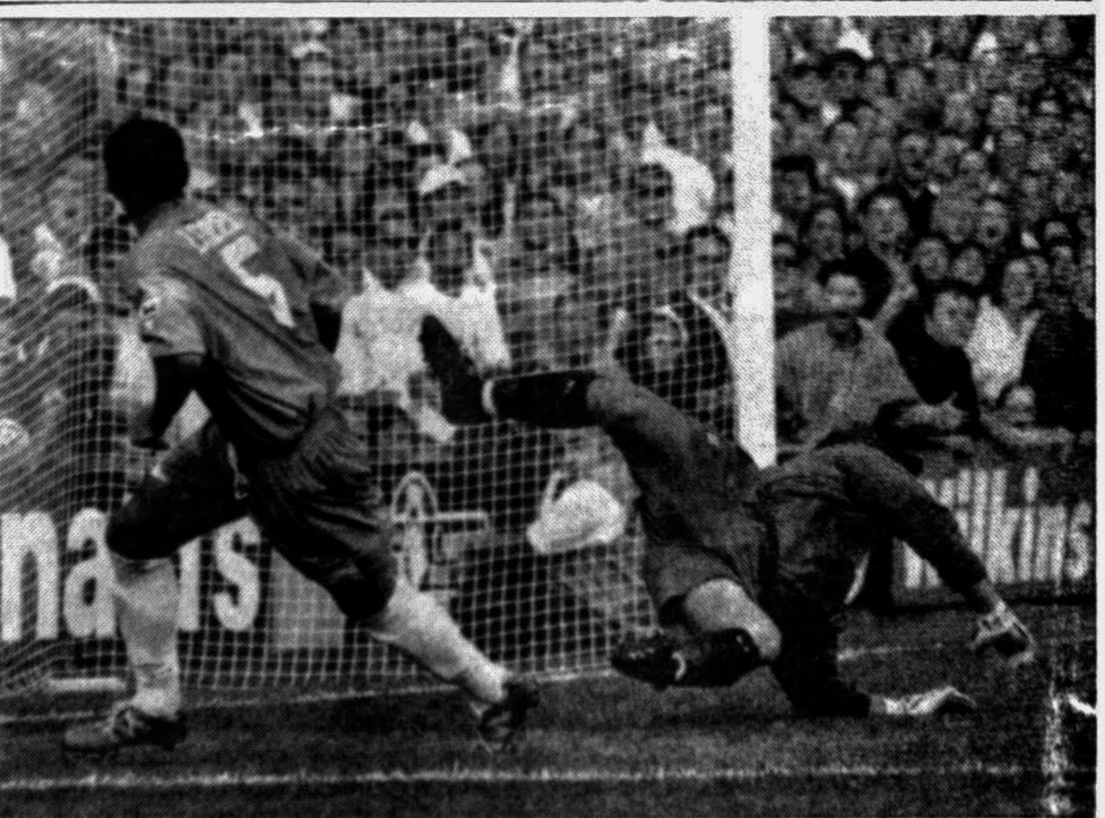
Aston Villa custodian Michael Oakes dives after Chelsea's Frank Leboeuf's placing shot went past him during their Premier league match at Stamford Bridge on Sept 15.

A police spokesman said: "This is one of the biggest races of its kind in the world and it's not rare for someone to die, but two deaths are unusual."