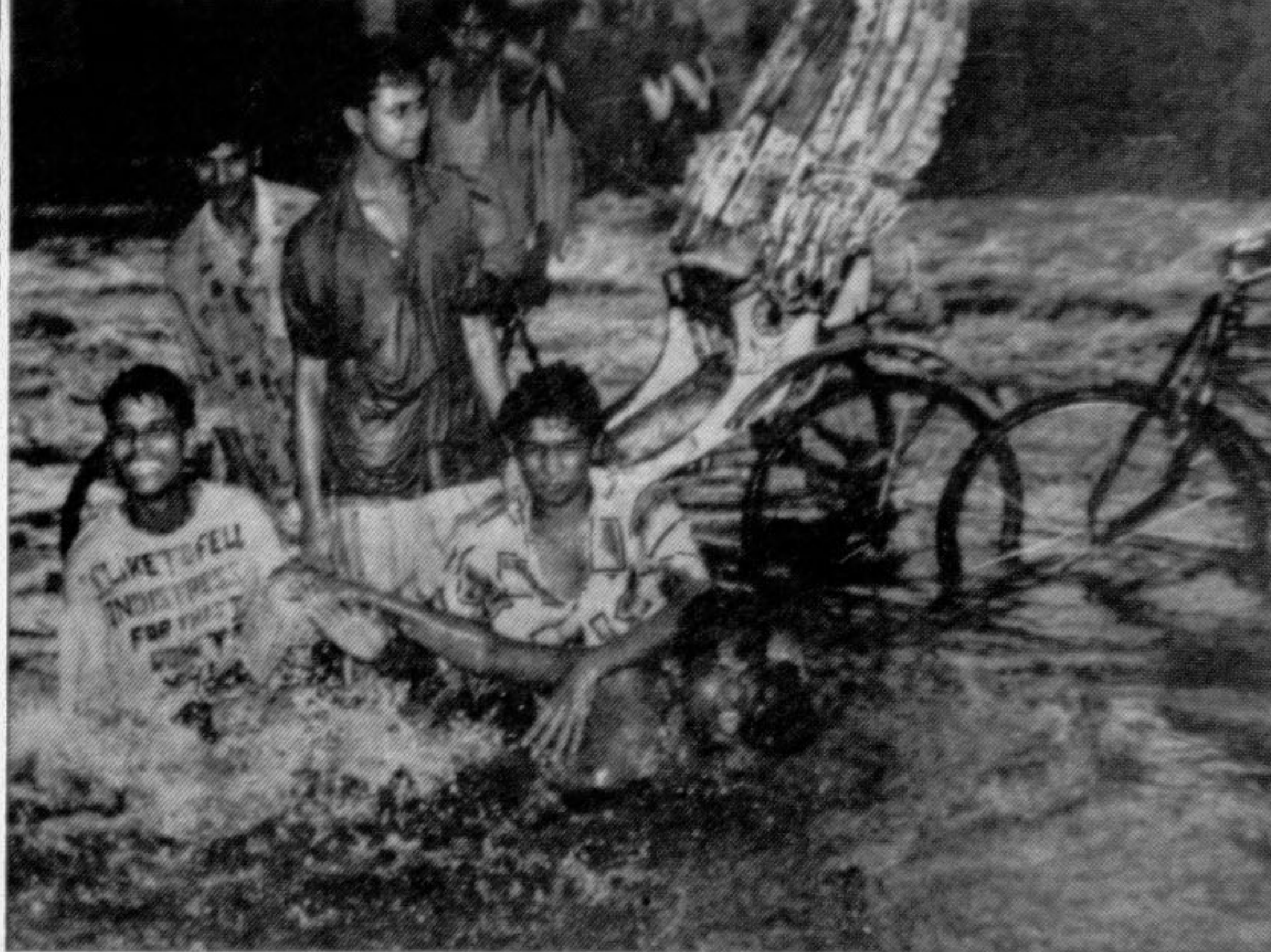
The city experienced a refreshing downpour yesterday following a wave of hot-spell in the last couple of days.

Executive Engineer Local Government Engineering Directorate Dist: Meherpur