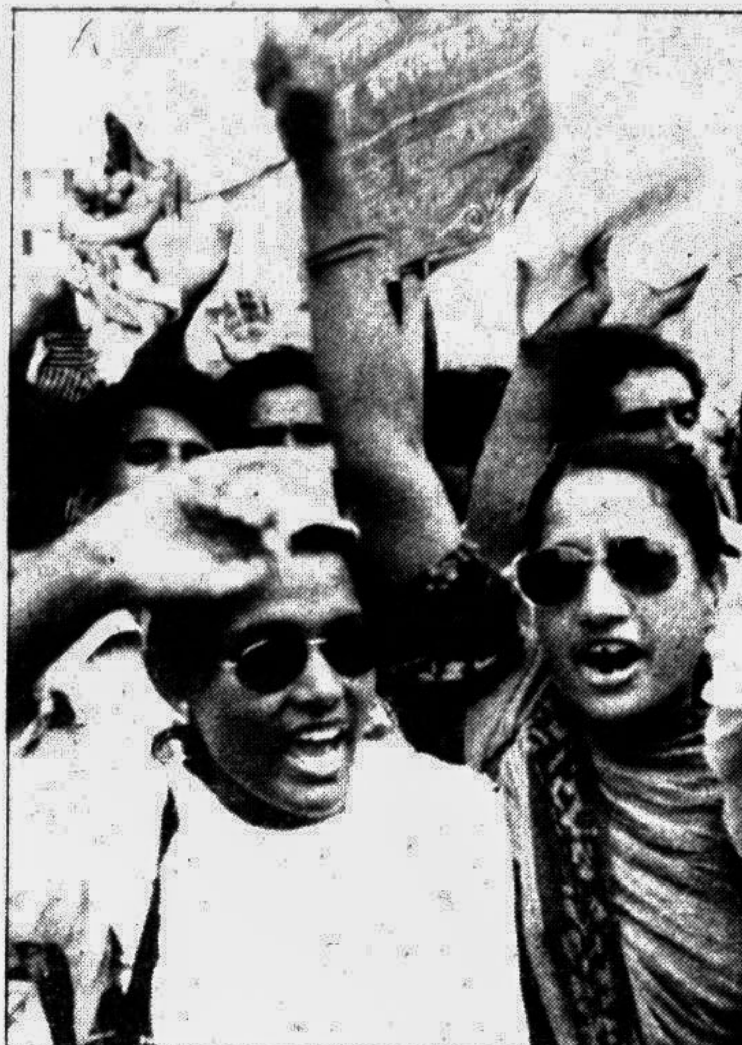
Employees of Power Development Board held a protest march in the city yesterday.