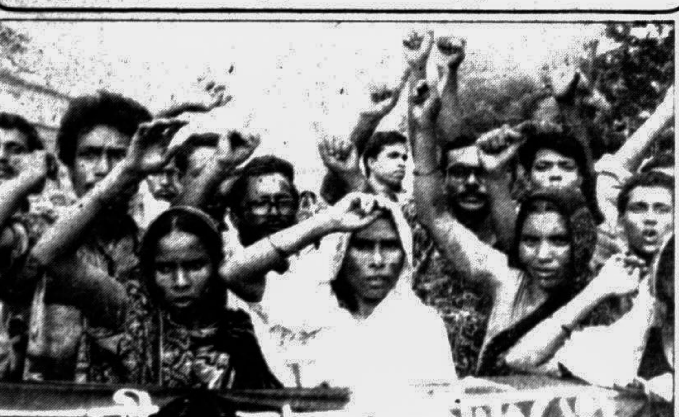
Members of Paribotya Gano Parishad brought out a procession in the city yesterday protesting the killings of 28 woodcutters in Rangamati recently.

Unlike other dreamers, after achieving considerable degree of success in business, he didn't forget his childhood aspirations. He first established this shelter in Uttara in 1987. But scarcity of land for further expansions led him to shift to Rajendrapur where he found ample land to facilitate the financial self-sufficiency of the centre, so that if anything should happen to him, his centre would not get closed down for the lack of funds. In future, he plans to expand his shelter with branches in Dhaka and elsewhere in the country as well as in all the SAARC countries. We just hope that more and more people are inspired by him to add to the common good instead of indulging in the rat-race we call life.