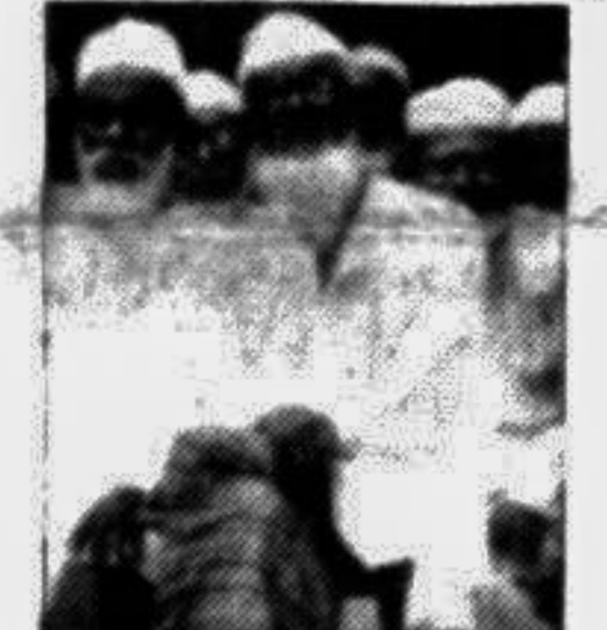
Caring for the Old Page 3