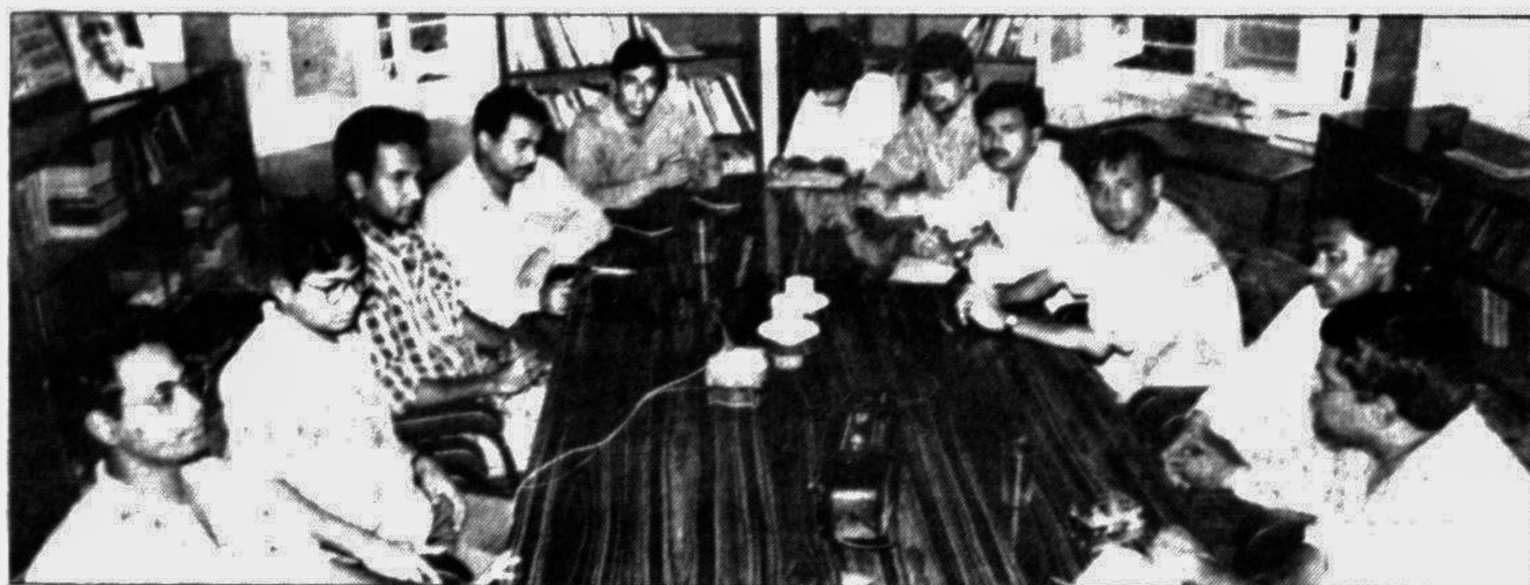
Student leaders of the Dhaka University exchanging views on the problems of campus at a discussion arranged by The Daily Star at its office yesterday.