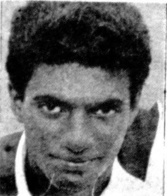
MURALITHARAN ... 5 for 33

when Sanath Jayasuriya at forward short leg held on to a bat-pad catch to get rid of Mark Dekker for 20 off the bowling of off-cutter Kumara Dharmasena. Craig Wishart, promoted in the batting after a half century in the first innings, left a ball from Silva and was bowled for two to leave Zimbabwe at 42 for two.