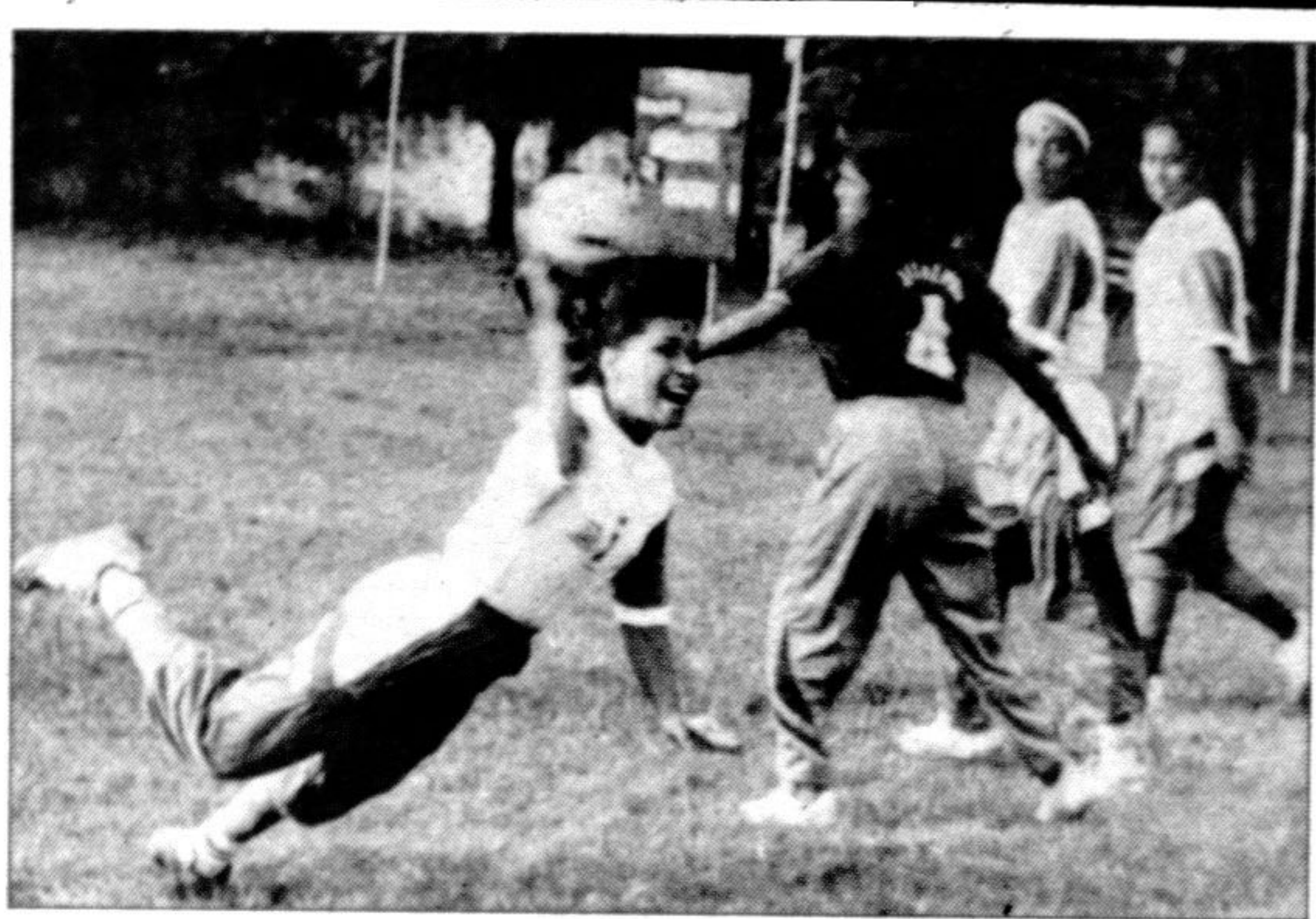
Action from yesterday's national women's handball match between BJMC and Jamalpur DSA at the Dhanmondi Women's Complex.

Bicycles are still by far the most popular form of transport in Vietnam. But since social and economic reforms were introduced in the late 1980s, its city streets have swarmed with motorbikes and increasingly, cars.