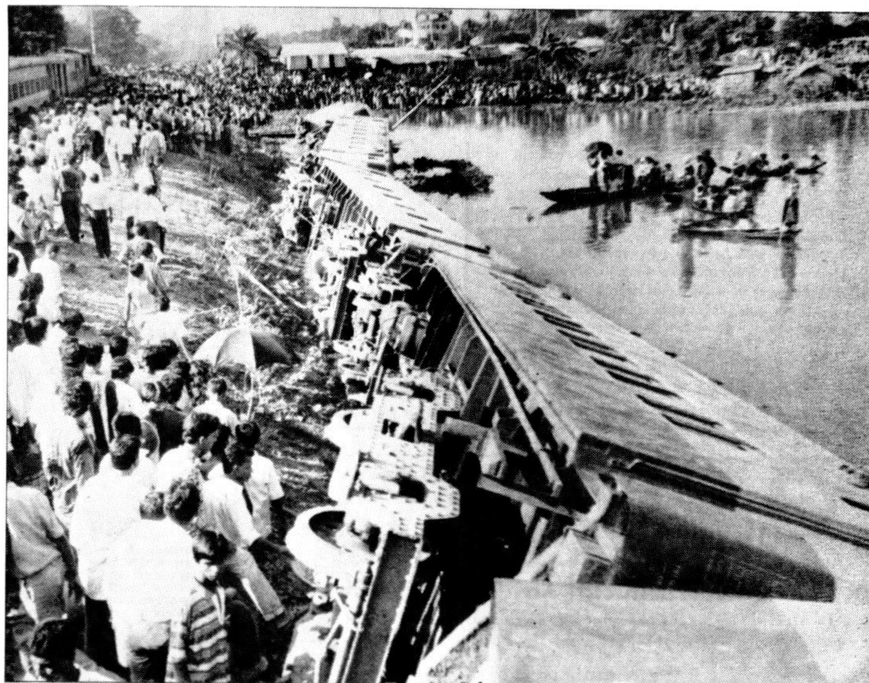
The derailed bogeys of the Mohanagar Urmi after the accident yesterday.