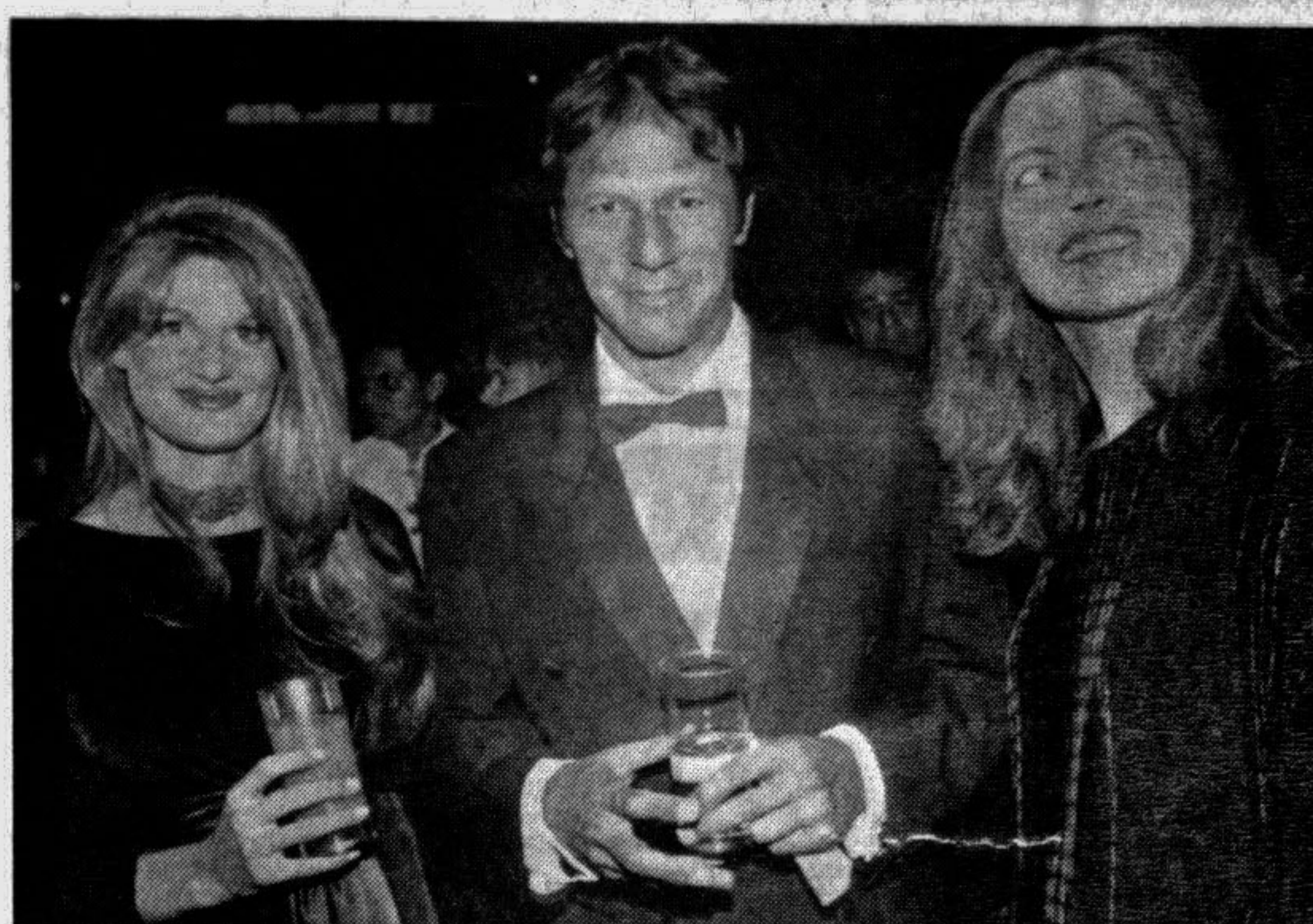
Former Pakistan cricket captain Imran Khan, with his wife Jemima, host a celebrity benefit for the UK opening of Emma, an adaptation of the Jane Austen novel in London on Sept 12. Starring actress Greta Scacchi is on the right.