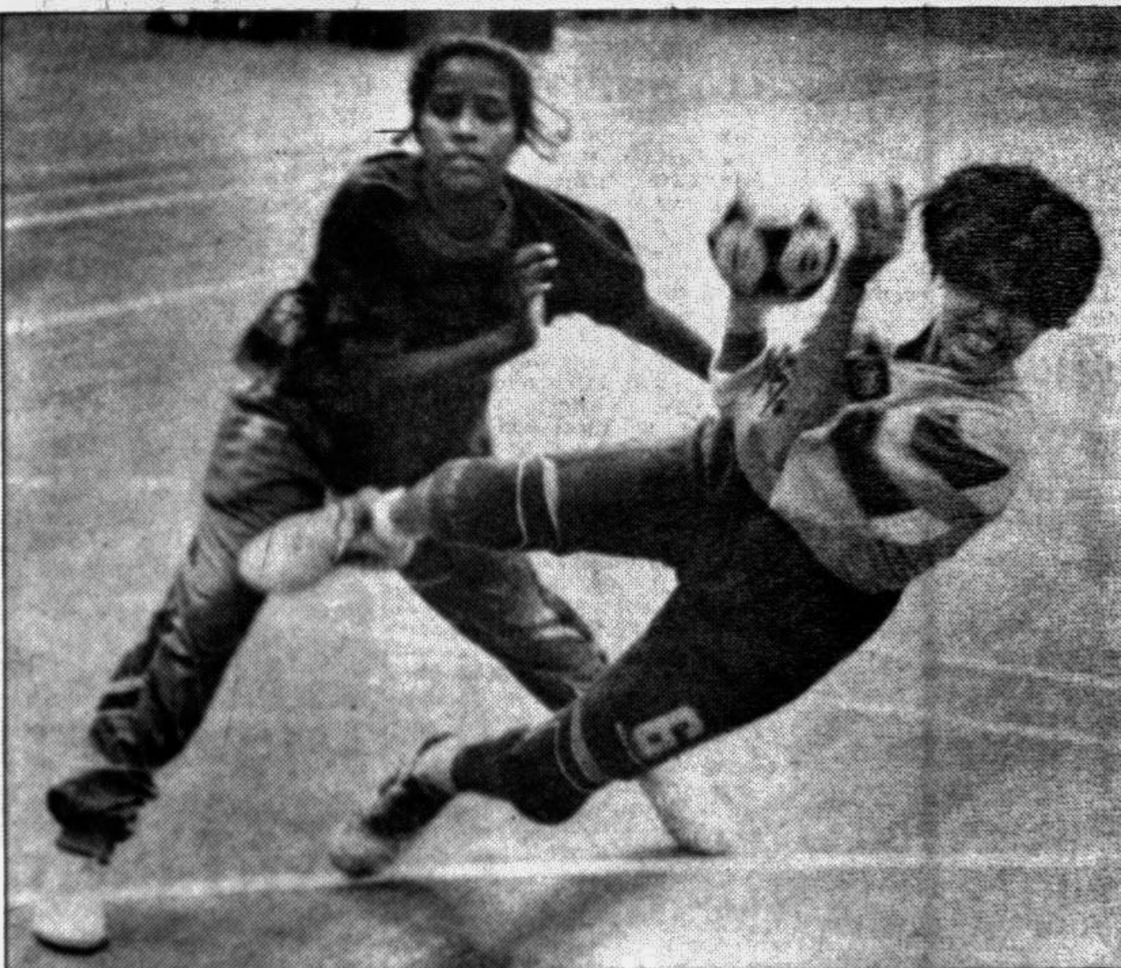
Dhaka on the attack in yesterday's Orient Bread national women's handball championship encounter against Jamalpur at the Indoor Stadium, Mirpur. Dhaka won the match 15-10.