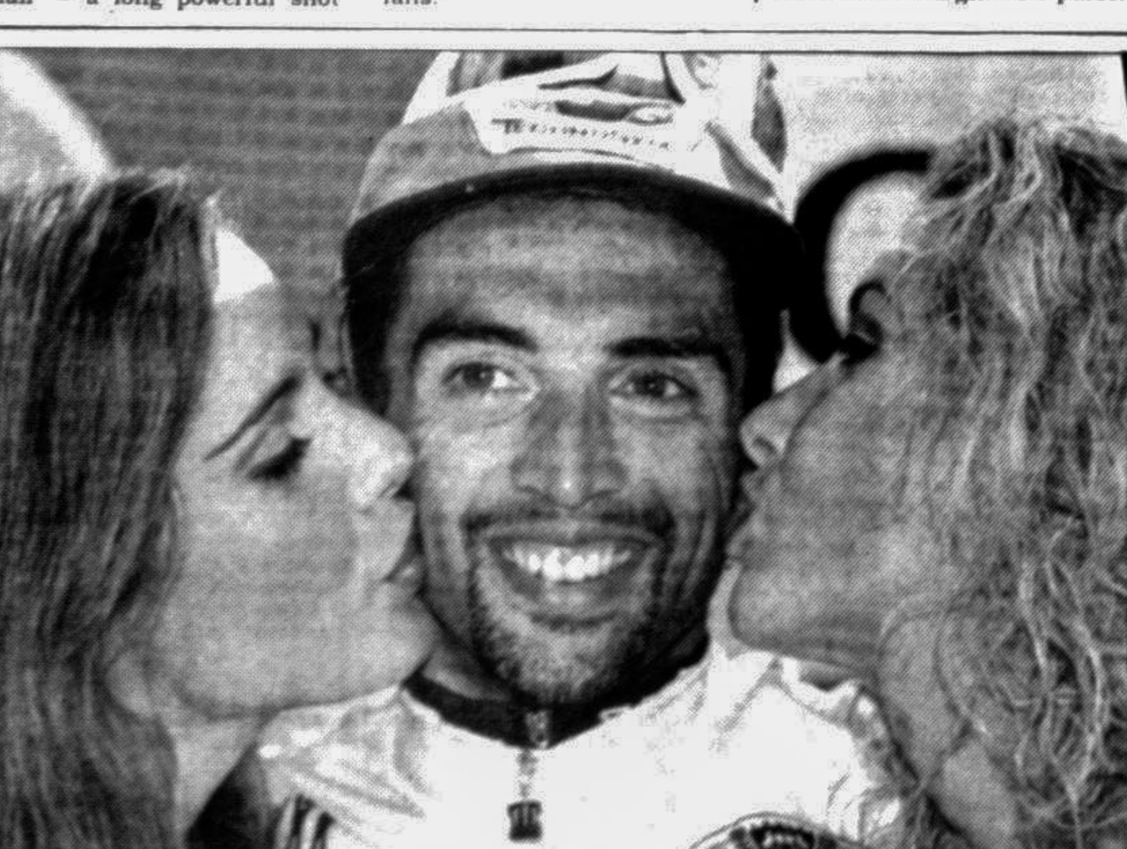
THE PICTURE SAYS IT ALL: Italian Fabio Baldato smiles on the podium after winning the sixth stage of the Tour of Spain cycling race in Malaga on Sept 12.

Kaiserslautern had plenty of chances to score more and Rehhagel said afterwards: "With a 2-0 win we would have had some peace of mind going to Belgrade. Now we'll have to go through hell in front of 80,000 fans."