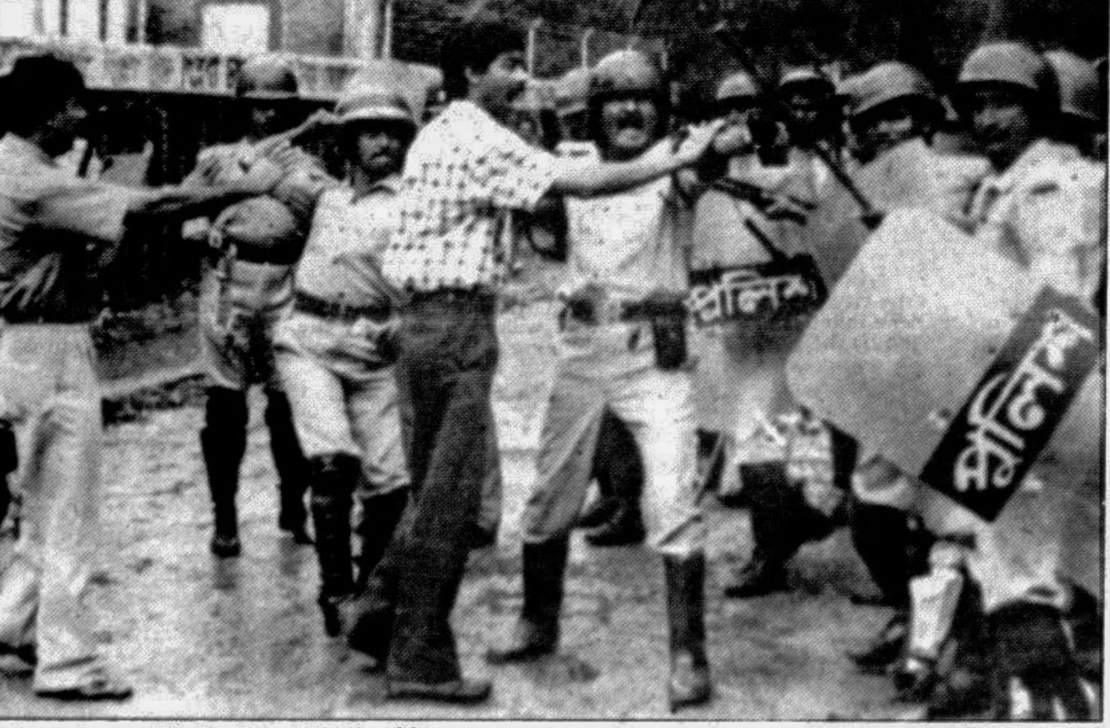
A campus scene! It should not be like this.

stringent action was taken against anybody. Because if it was, it would have been published by the media.