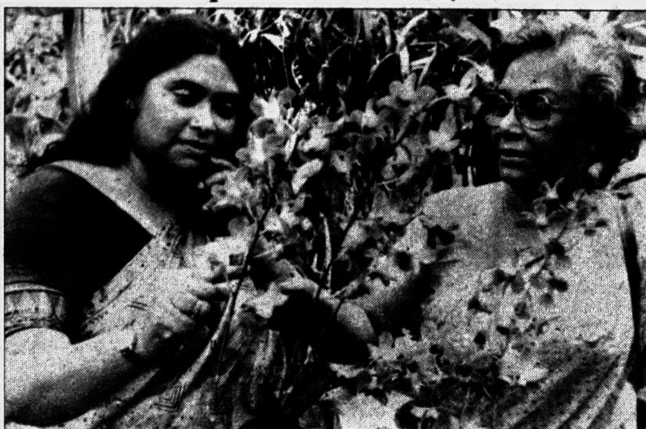
Visitors at an orchid show organised by the Orchid Society of Bangladesh in the city yesterday.

Some people also assume that karate is for the males. But karate takes men and women in equal terms. Karate makes no sexual discrimination. No wonder, many children in big cities of the world are being taught karate at schools so that they can cope with the dangers of increasing crime and violence.