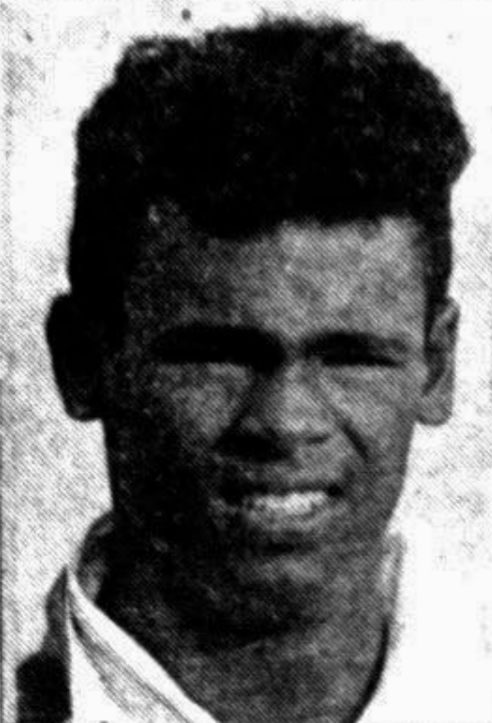
Vinod Kambl (India's controversial cricketer) "I don't see any competition between me and Saurav (Ganguly)."