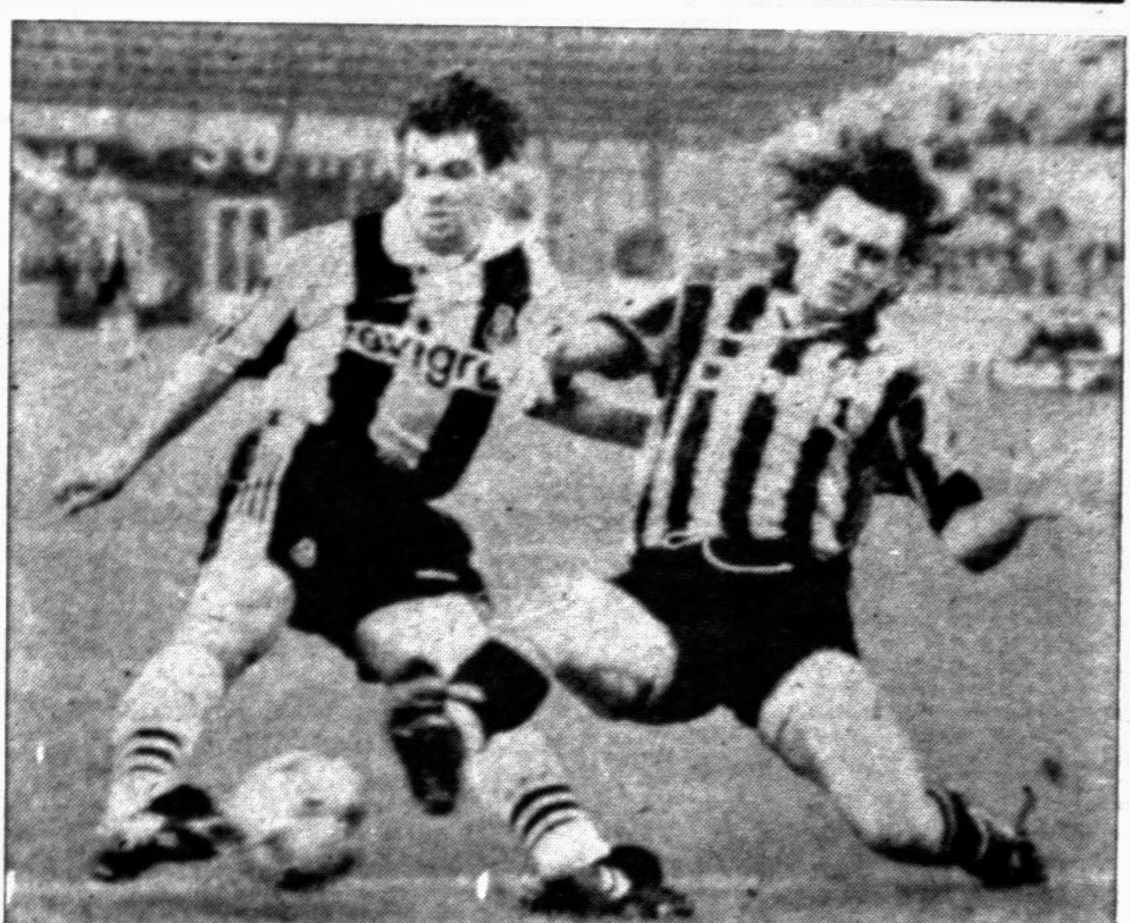
Paolo Maldini of the AC Milan tries to stymie Sergio Conceicao of the Porto during their European Champions League match in Milan on Sept 11. Porto jolted the Italian giants with a 3-2 victory.

The Federal Bureau of Investigation had no comment on the report, which did not name the new suspect.