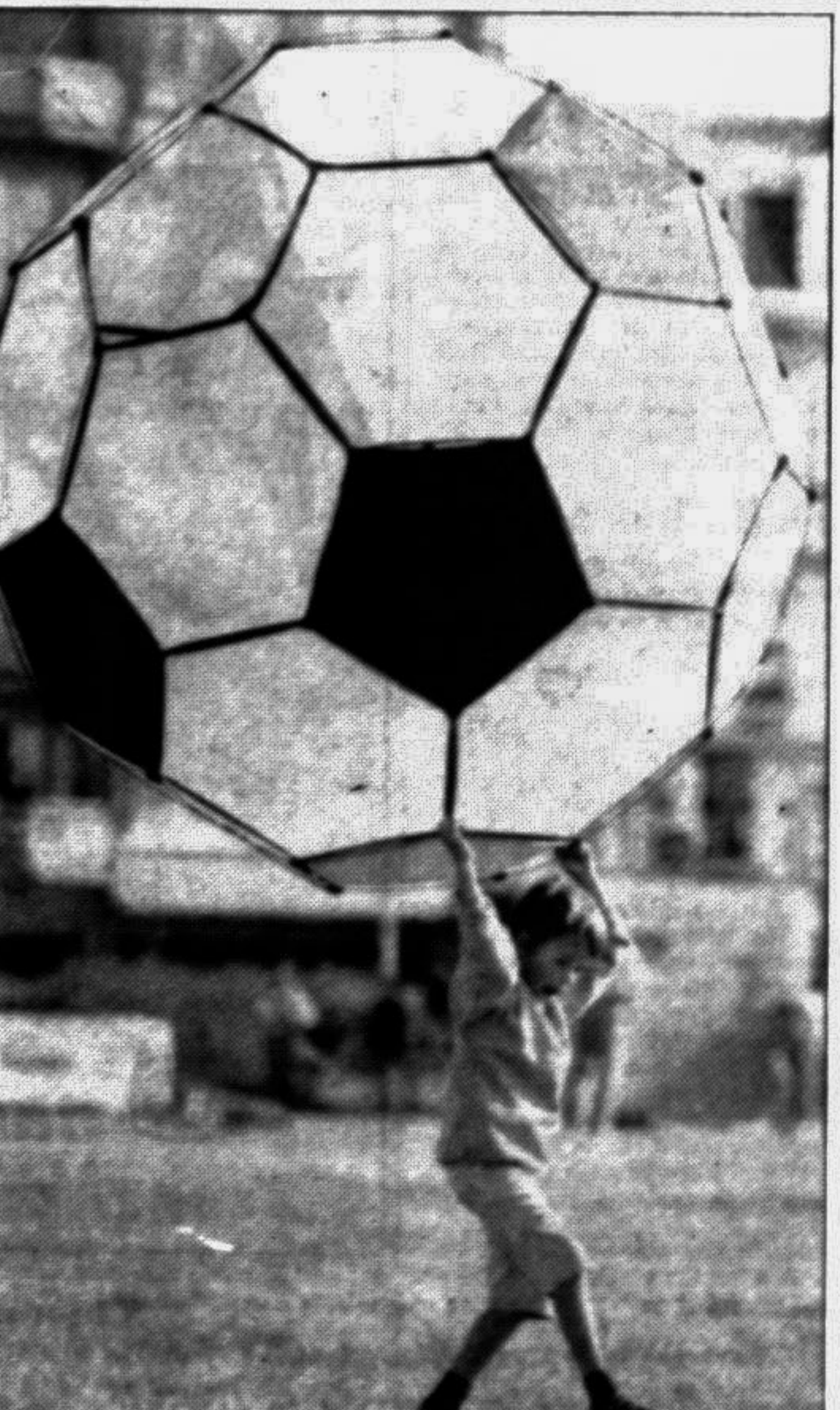
A child carries a soccer ball shaped kite during an international festival in the northern French port city of Dieppe on Sept 8.