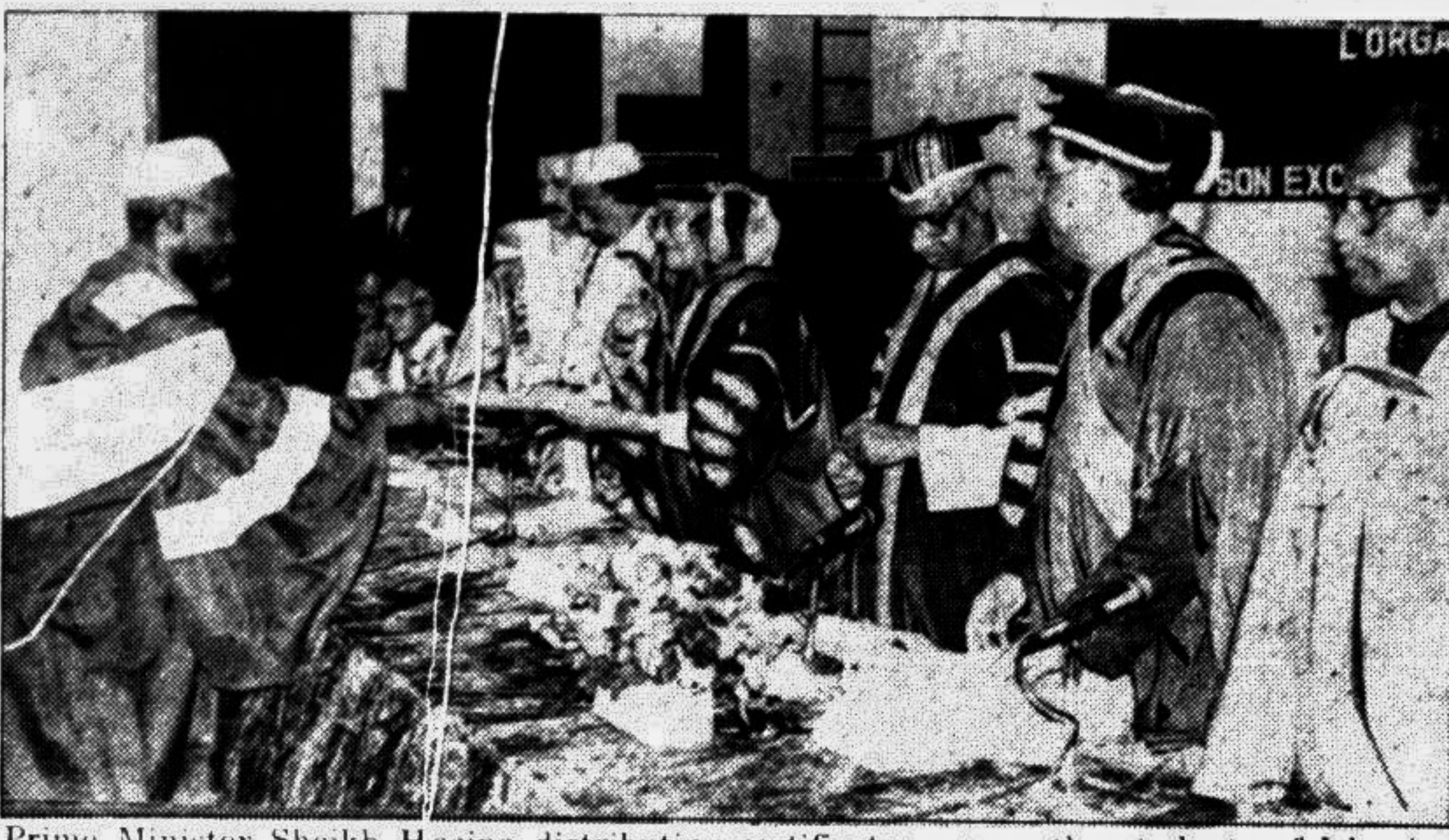
Prime Minister Sheikh Hasina distributing certificates among the students of Islamic Institute of Technology (IIT), Gazipur, at a convocation yesterday.

Mohsin warned that 'the association will be forced to take its own programme if such incidents are repeated'.