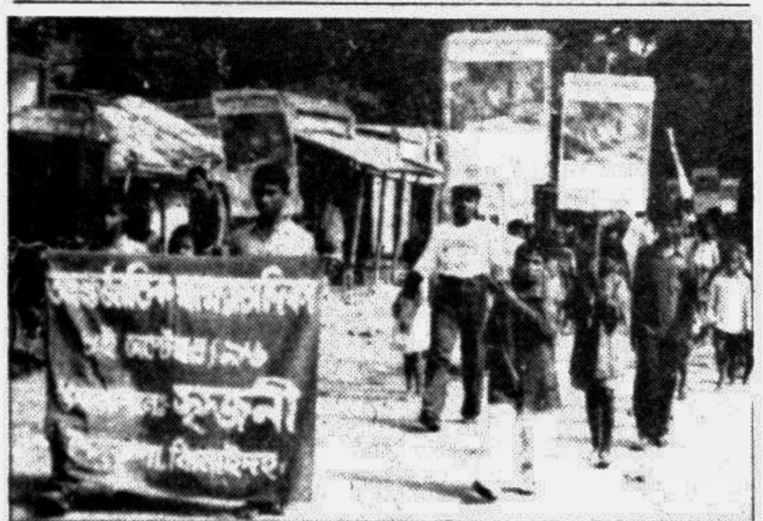
JHENIDAH: A colourful rally was brought out recently in Saikupa town by SRIZON on the occasion of International Literacy Day.

Most of the villages in Cox's Bazar district have become treeless. As a result rainfall have become scanty and excessive hot weather is prevailing.