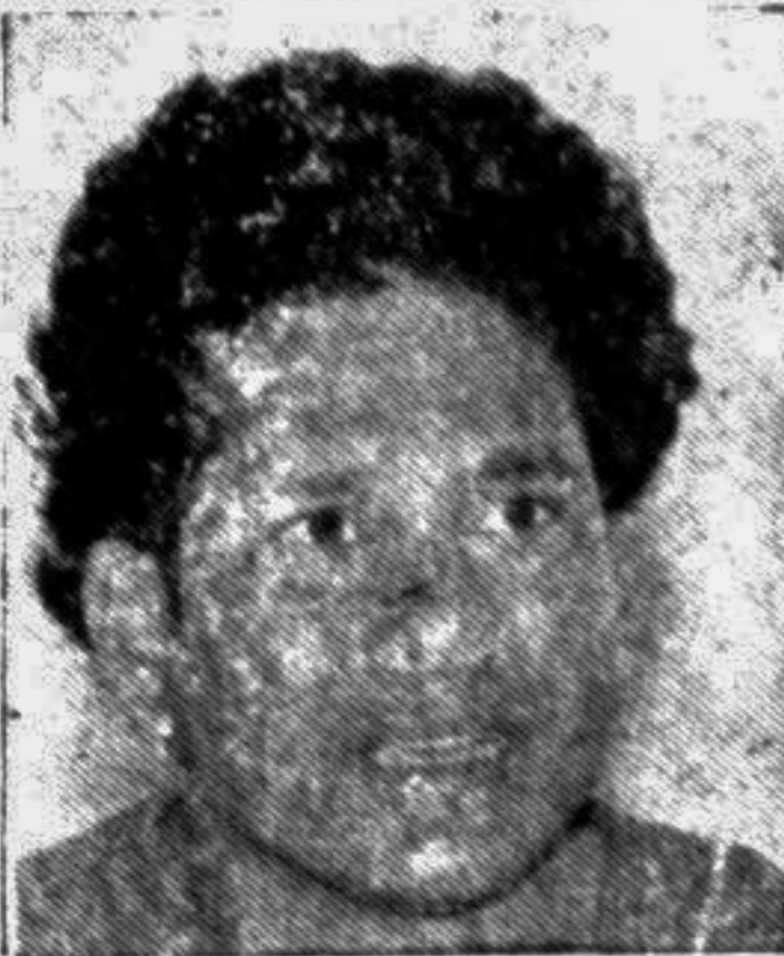
Sachin Tendulkar (Indian cricket captain) 'I try to keep my life into two separate parts. I do not allow the commercial side to intrude into the game.'