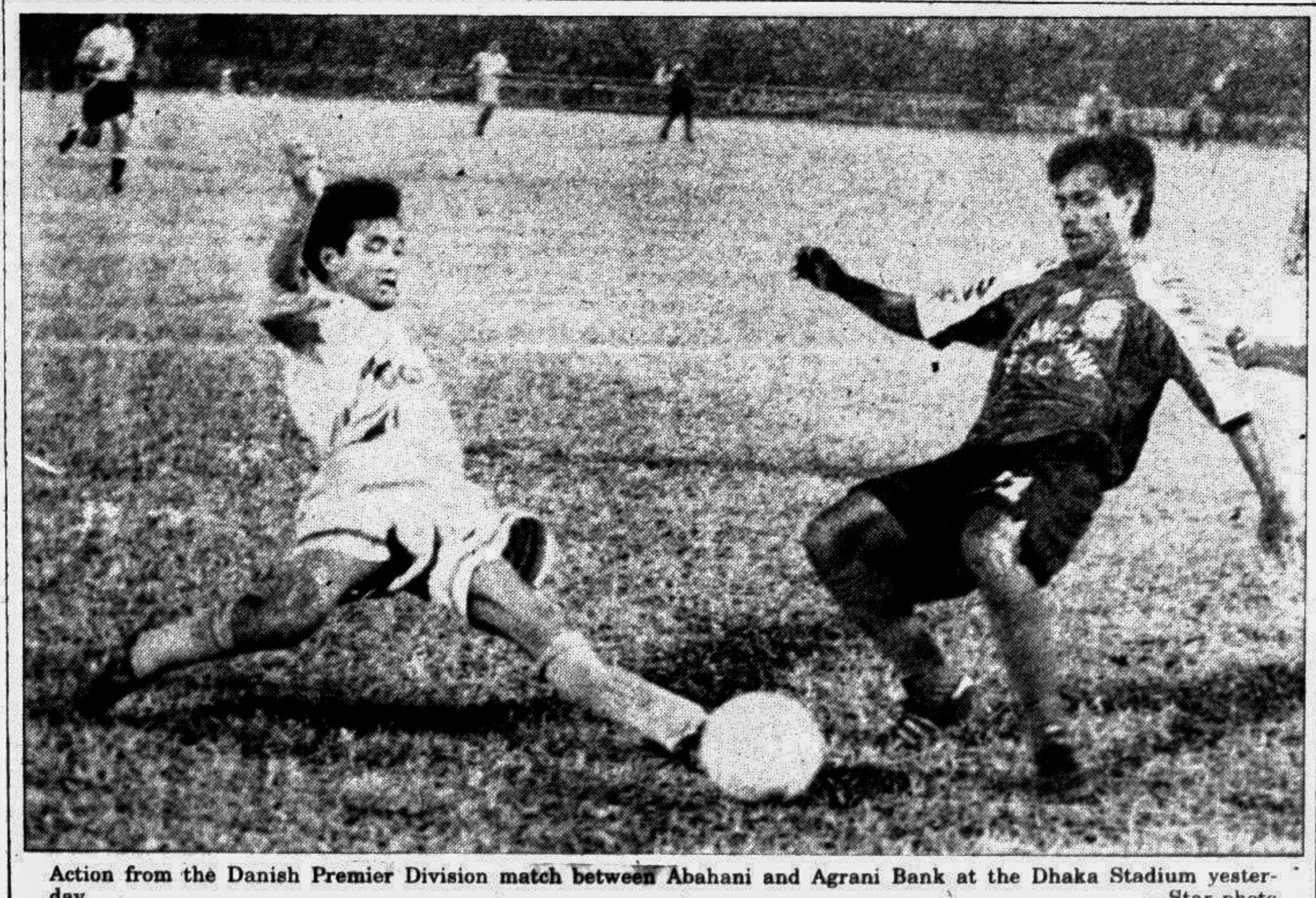
Action from the Danish Premier Division match between Abahani and Agrani Bank at the Dhaka Stadium yesterday.

CRYPTOQUIP SCN, RSUE, WNW RSU IDEK, TCCY, LUFMDL ZK, TLDYUW, FMIOD? NMRS, RCZDRC, FIDRU. Yesterday's Cryptquip: THAT GRUMPY TREE SURGEON SAYS HE'S TOO SPENT TO STIR HIS STUMPS. Today's Cryptquip clue: T equals C The Cryptquip is a substitution cipher in which one letter stands for another. If you think that X equals O, it will equal O throughout the puzzle. Single letters, short words and words using an apostrophe give you clues to locating vowels. Solution is by trial and error.