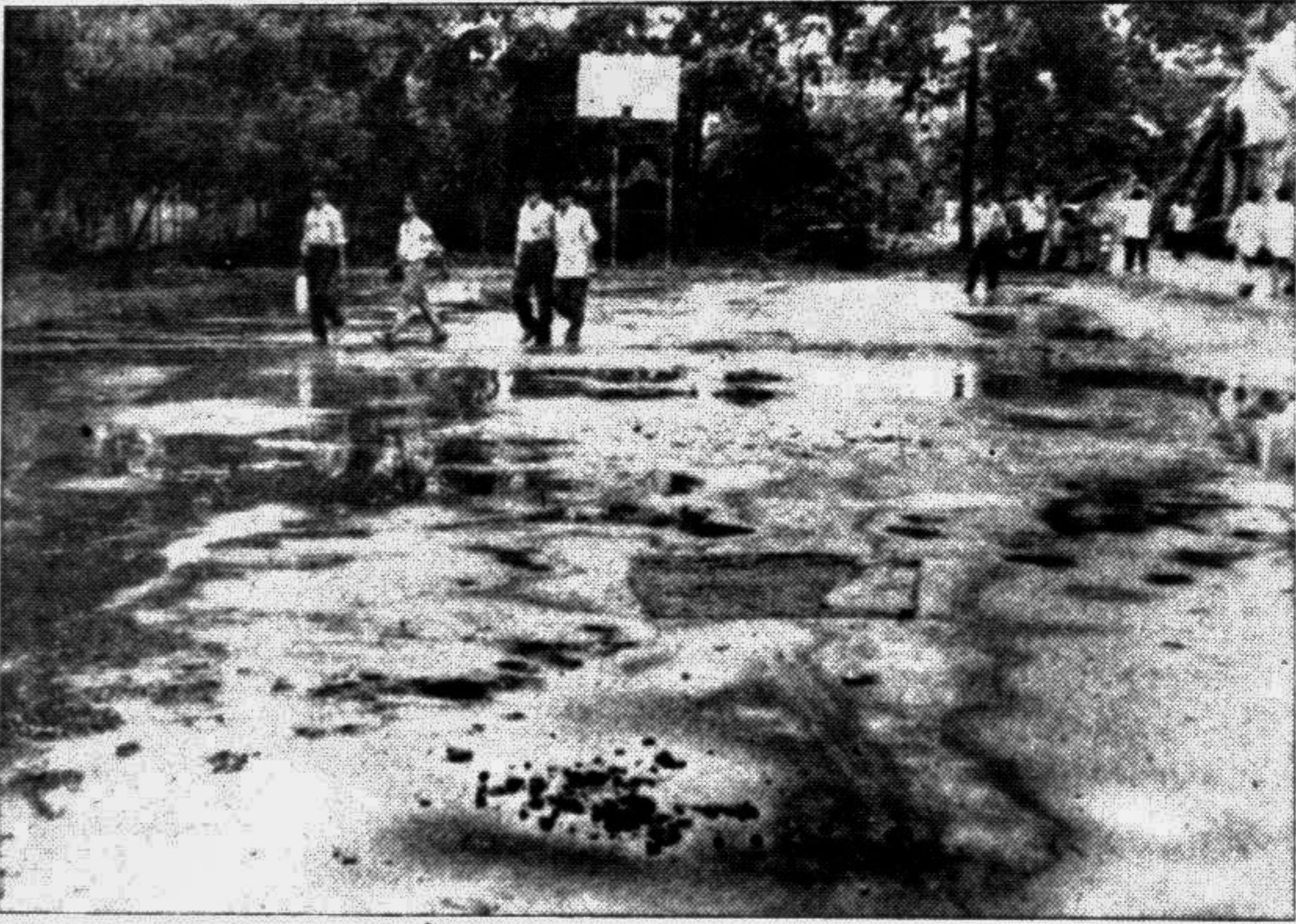
This basketball court of a DU hall is no longer used and is fast heading for total disintegration.

Added to this, there're two swimming pools that haven't been used for a long, long time. One of these facilities is a portion of the complex beside Curzon Hall, occasionally operated whenever any event of national importance pops up. And the other at TSC which is a prohibited site for the students for reasons unknown. The whirl of athletes and the Yaa-hoo of dribblers in the DU sports arena are the torn strings of a mandolin. What's however consoling 's that a few students of the university are still the heroes in some sports disciplines of the country.