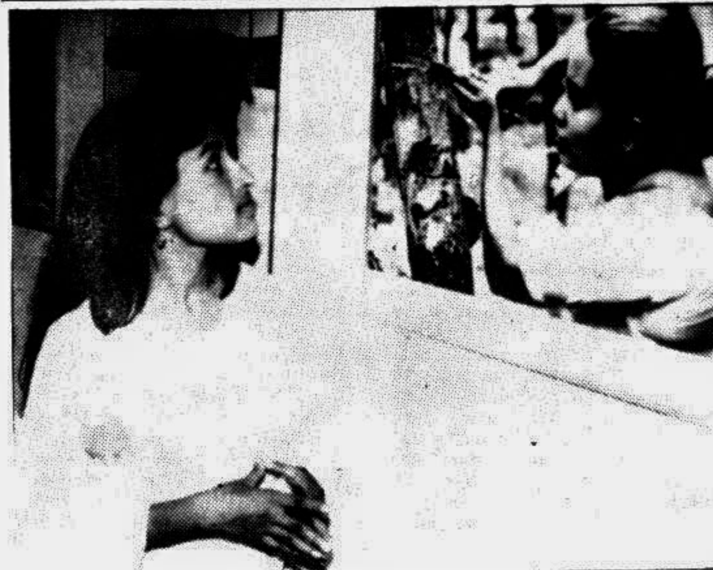
A photo exhibition of the Asian Cultural Centre for UNESCO, titled 'People at Work' opened at the Shilpakala Academy gallery in the city yesterday.