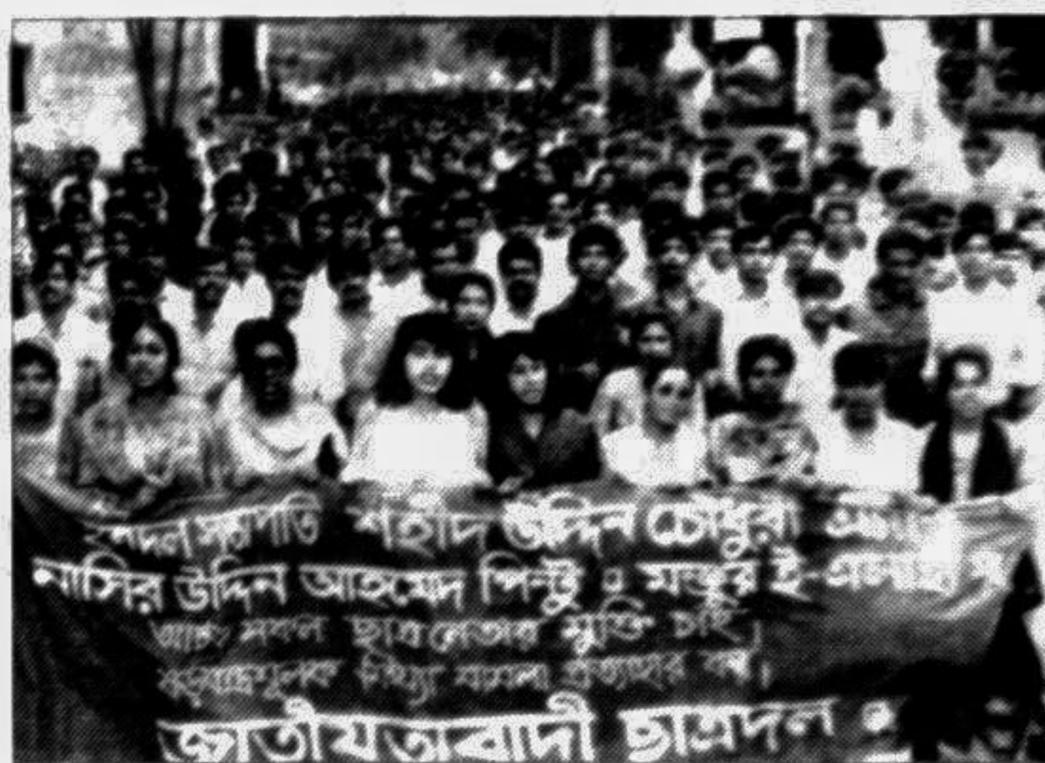
Jatiyatabadi Chhatra Dal brought out a procession on Dhaka University campus yesterday demanding the release of arrested JCD leaders.

LGRD and Cooperatives Minister Zillur Rahman yesterday expressed his profound shock at the sudden death of popular filmstar Salman Shah, reports BSS. In a condolence message, Zillur Rahman said late Salman Shah earned respect and popularity through his creative performances in our film industry. Meanwhile, Shipping Minister ASM Abdur Rob expressed profound shock at the death of film actor Salman Shah. In a condolence message, the minister said the country had lost a renowned filmstar at the death of Salman Shah.