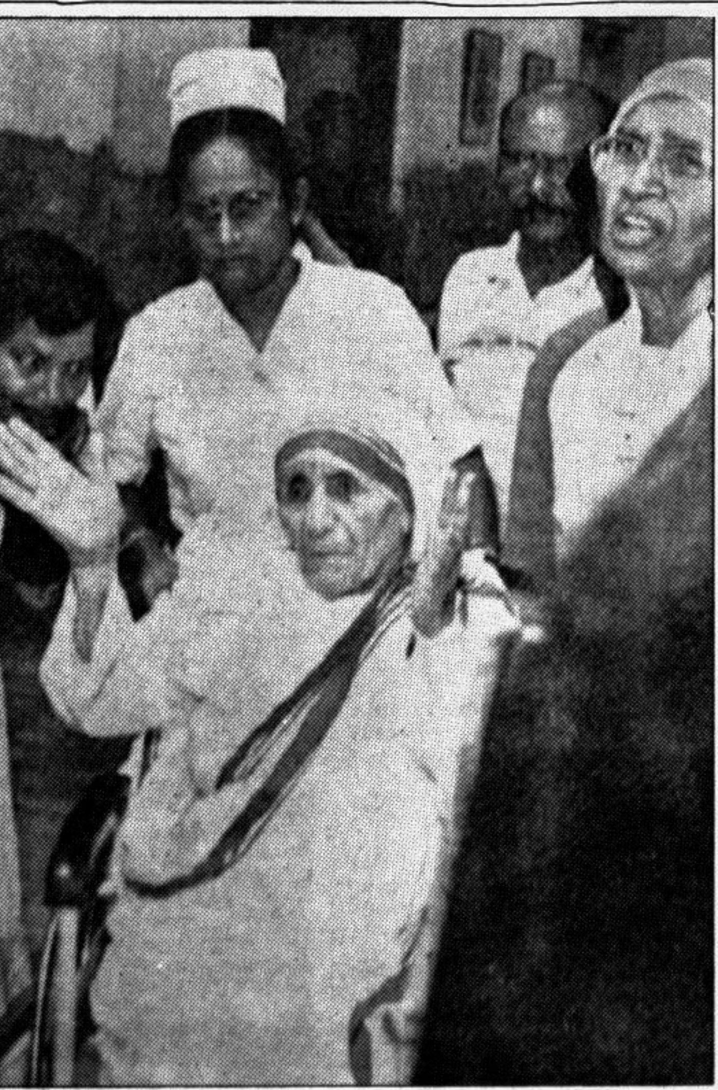
Mother Teresa in a wheelchair being escorted out of the Woodland Nursing Home in Calcutta yesterday from where she was discharged after 17 days. The 86-year-old Nobel Peace laureate was allowed home following a recovery from heart problems.

From Page 1 The warranty period that ends in November. The CPA has already asked the manufacturer to send its expert to check the line items. An expert is expected to arrive here by this month, a source said. Meanwhile, another source added that the CPA is going to procure ten more forklifts of various capacities very soon, and that the same Italian company has been given the highest points in tender bidding although the CPA's purchase procedures specify that "adverse performance report" from any customer will make the bid liable for rejection. The source said that the truck had developed a major fault within eight months of commissioning. He added that some of the trucks had been facing problems in hydraulic systems a few months after commissioning. When pointed out that CPA itself is a customer, an official said, "It cannot yet be said firmly that the trucks have performed badly."