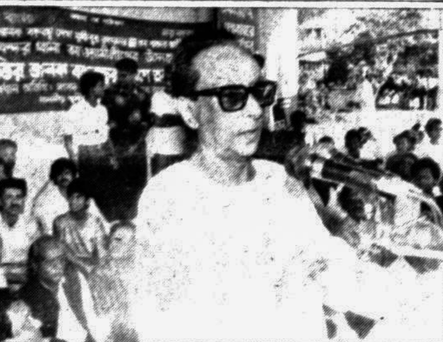
LGRD and Cooperatives Minister Zillur Rahman speaking at a public meeting at Bandar thana of Narayanganj yesterday.

Rotaract Club of Notre Dame College: The 6th installation ceremony of the club will be held. Venue: Notre Dame College auditorium. Time: 5:30 pm.