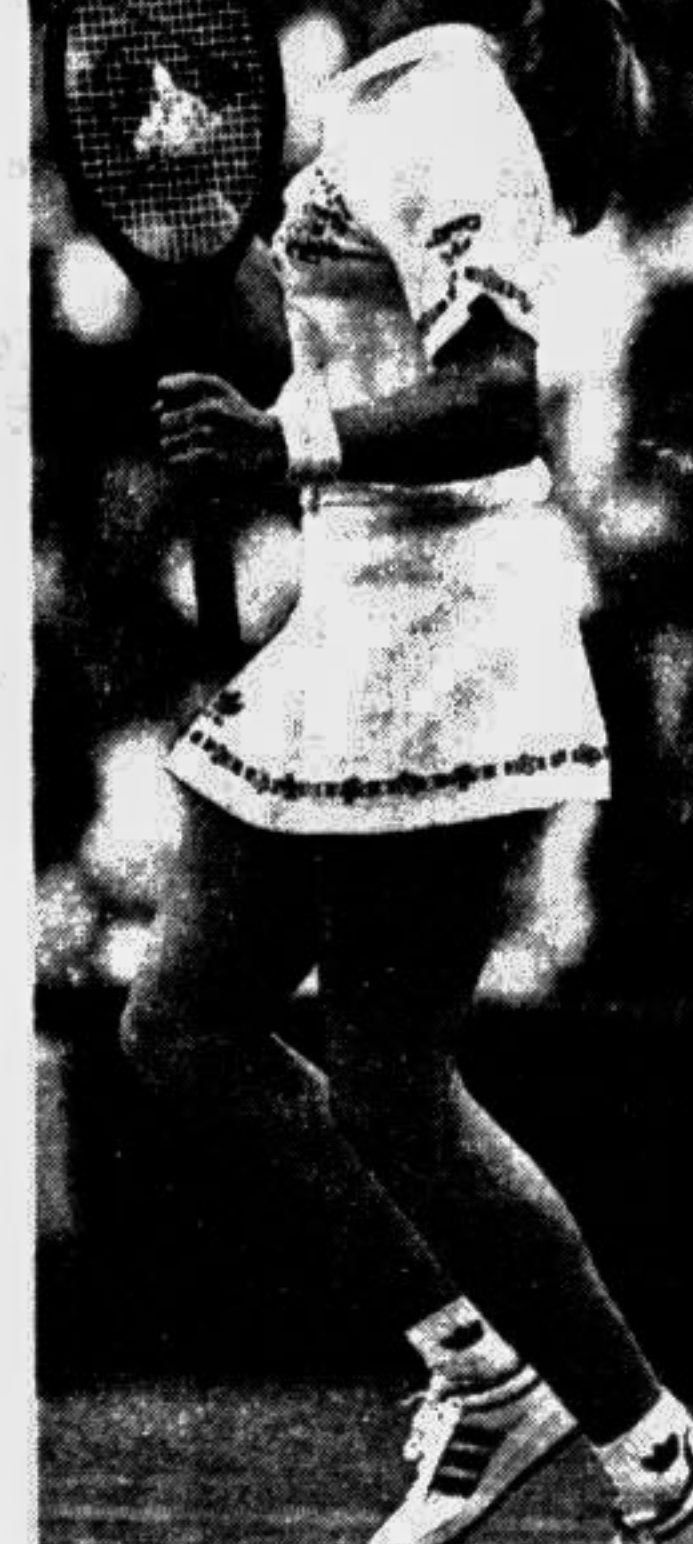
STEFFI GRAF held at 30 to take a 5-4 lead. In the sixth game, Wiesner saved one set point, but not the second as Graf closed out the hard fought, 42-minute, first set battle.

Graf, however, hasn't had 20 Grand Slam tournament titles just handed to her. She held at 15, broke Wiesner at 30, then