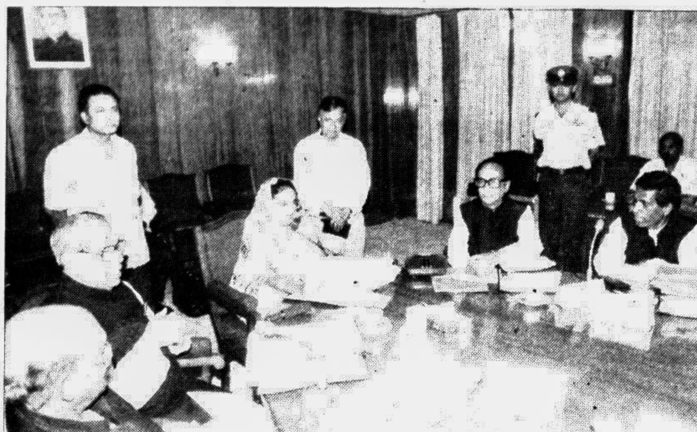
Prime Minister Sheikh Hasina inaugurated the 8,500-line Rajshahi digital telephone exchange by talking to Post and Telecommunications Minister Mohammad Nasim in Rajshahi from the Cabinet Room of the Bangladesh Secretariat in the city yesterday.