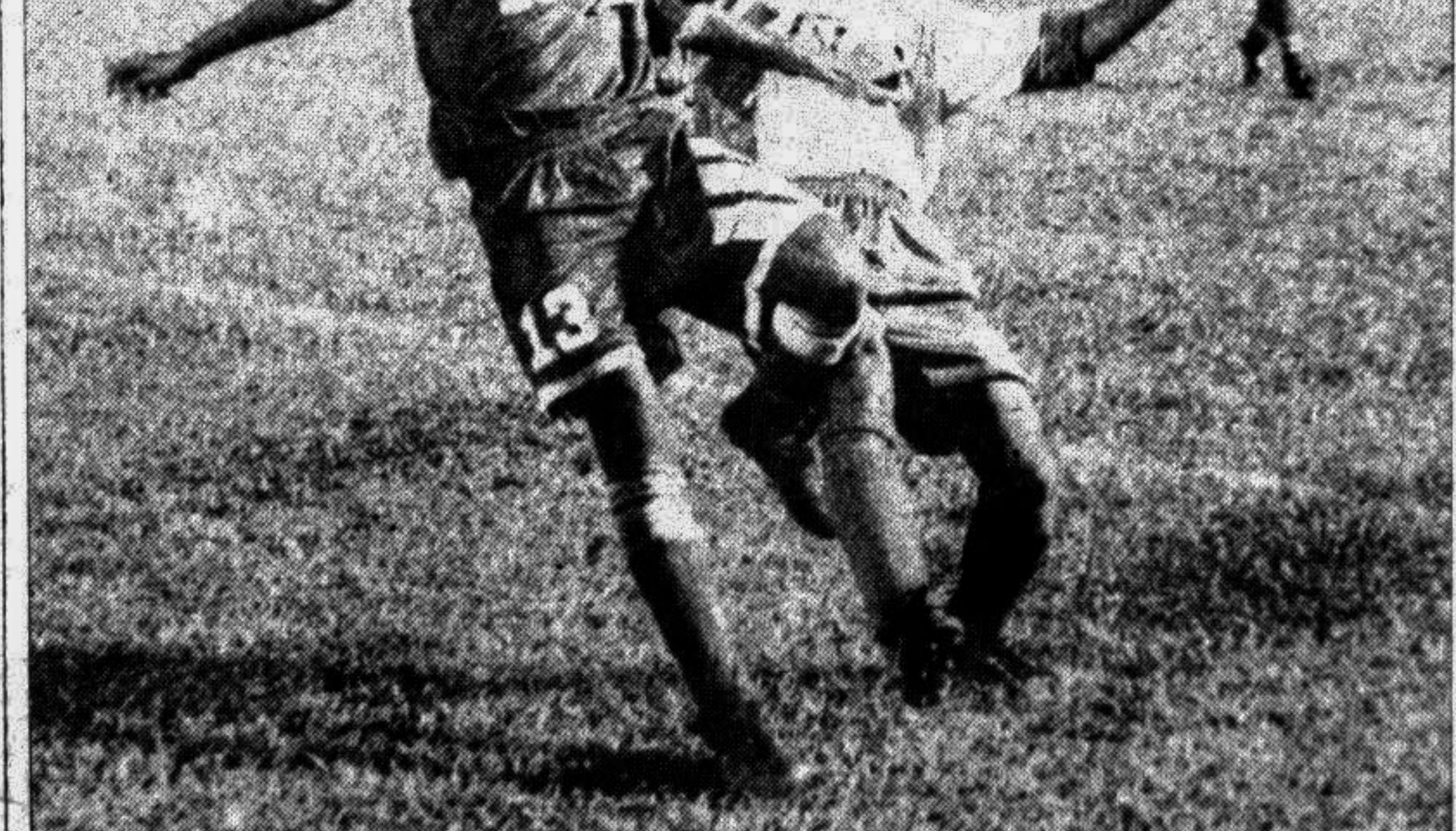
Action from yesterday's Danish Premier Division football league engagement between Muktiyoddha Sangsad and Youngmens Club Fakirerpool at the Dhaka Stadium which ended in a goalless draw.