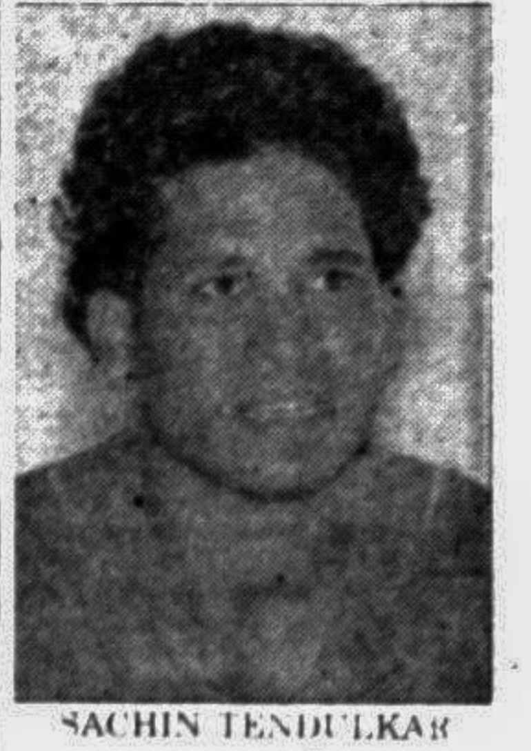
SACHIN TENDULKAR taking on any one of them." With both Tendulkar and Healy desperate to win, the key encounter at the Sinhalese Sports Club (SSC) ground promises to be an edge-of-the-seat thriller. "We are keyed up for the crunch game," said Tendulkar

IAN HEALY nath, Venkatesh Prasad, Sunil Joshi, Vikram Rathore, David Johnsson, Ashish Kapoor.