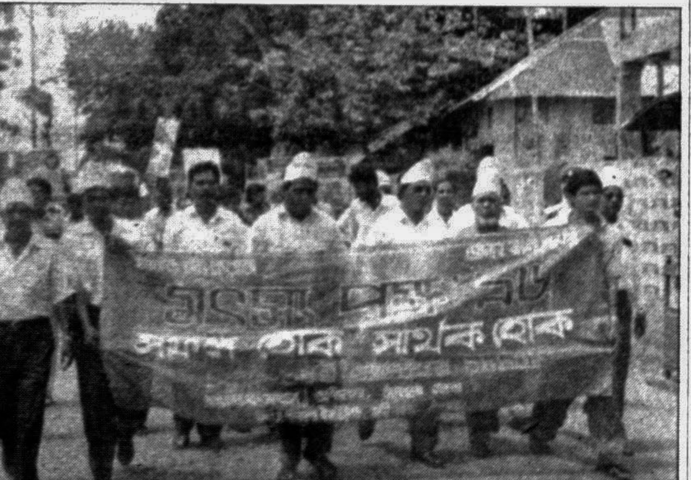
CHANDPUR: A colorful rally was brought out which paraded the main streets of the town for creating awareness among the people about the fish production, preservation and marketing on the occasion of fish fortnight.