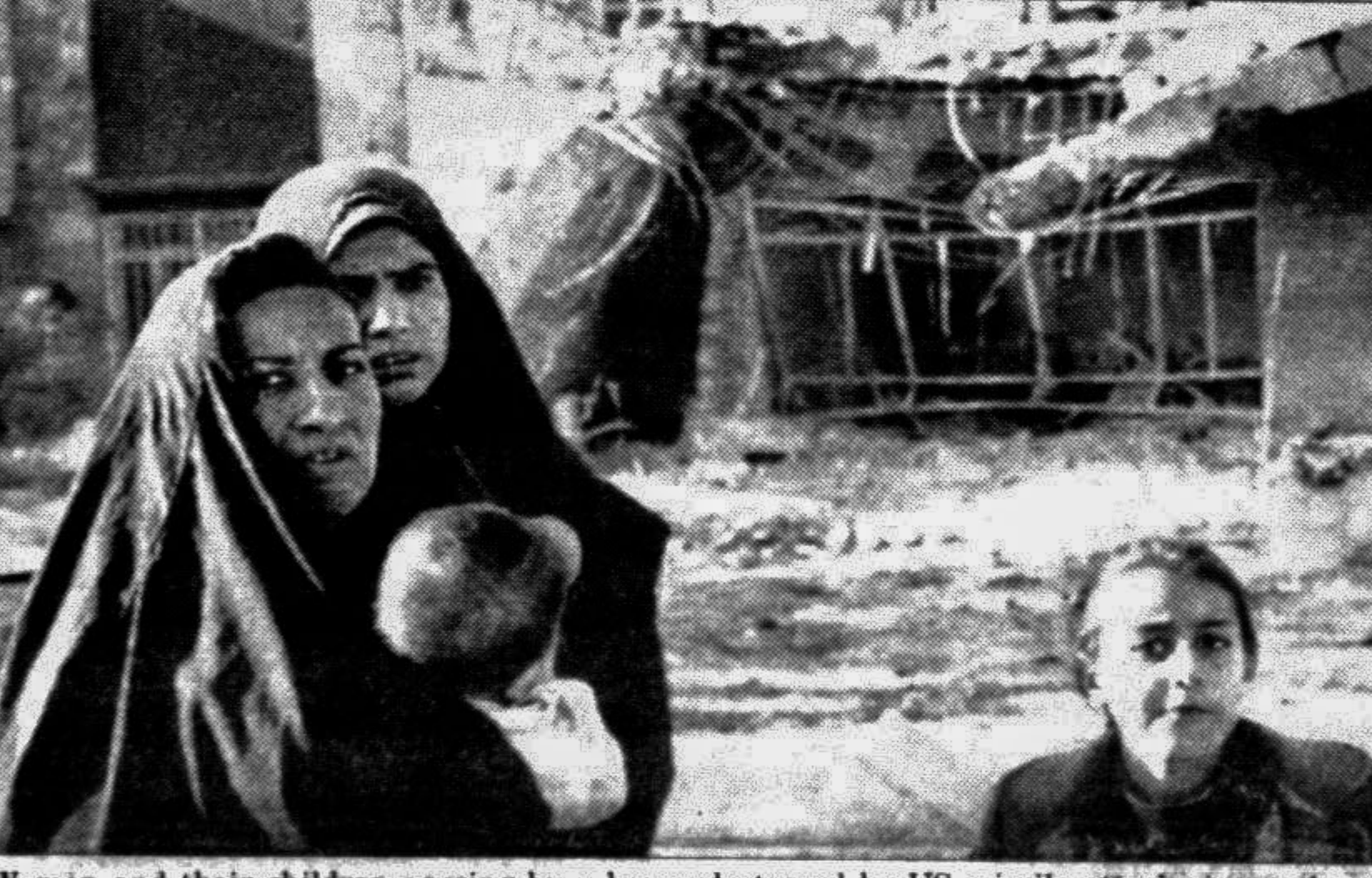
Women and their children passing by a house destroyed by US missile attacks in southern Iraq on Tuesday.

BAGHDAD, Sept 4: Air raid sirens blared before dawn today as the United States launched cruise missiles at Iraqi air defense sites for the second time in two days, reports agencies. In Washington, US officials said 17 missiles were fired from three ships and one submarine in the Gulf, targeting Iraqi air defense systems in southern Iraq. The targets weren't destroyed in the first strike, they said. Though the targets were well south of the Iraqi capital, air raid sirens went off shortly before sunrise at 5:30 am (0130 GMT). The purpose of the attacks is to "suppress Iraq's air defense capability in the south as the United States and its Western allies widen a no-fly zone in southern Iraq today to the 33rd parallel, closer to Baghdad from the 32nd parallel, a US official said. Large explosions were heard in Baghdad this evening. See Page 12 Col 6