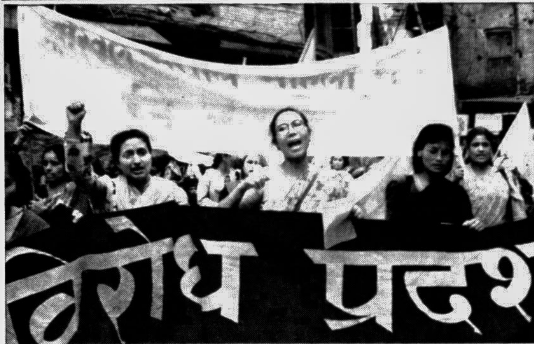
Members of the leftist All Nepal Women's Unity Centre demonstrating in Kathmandu yesterday against the Indo-Nepal Mahakali River Integration Development Project Treaty.

For more information call - Head Office: 9665114-Fax: 9665112 Gulshan: 967771, Chittagong: (031)712127, Khulna: (041) 25006