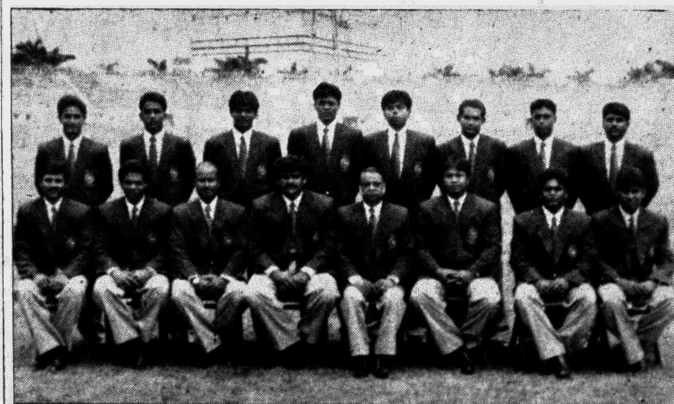
The Bangladesh cricket team which will leave the country for Malaysia today to participate in the ACC Trophy.

"No umpires," McEnroe said. "You don't need them when you have stuff like this."