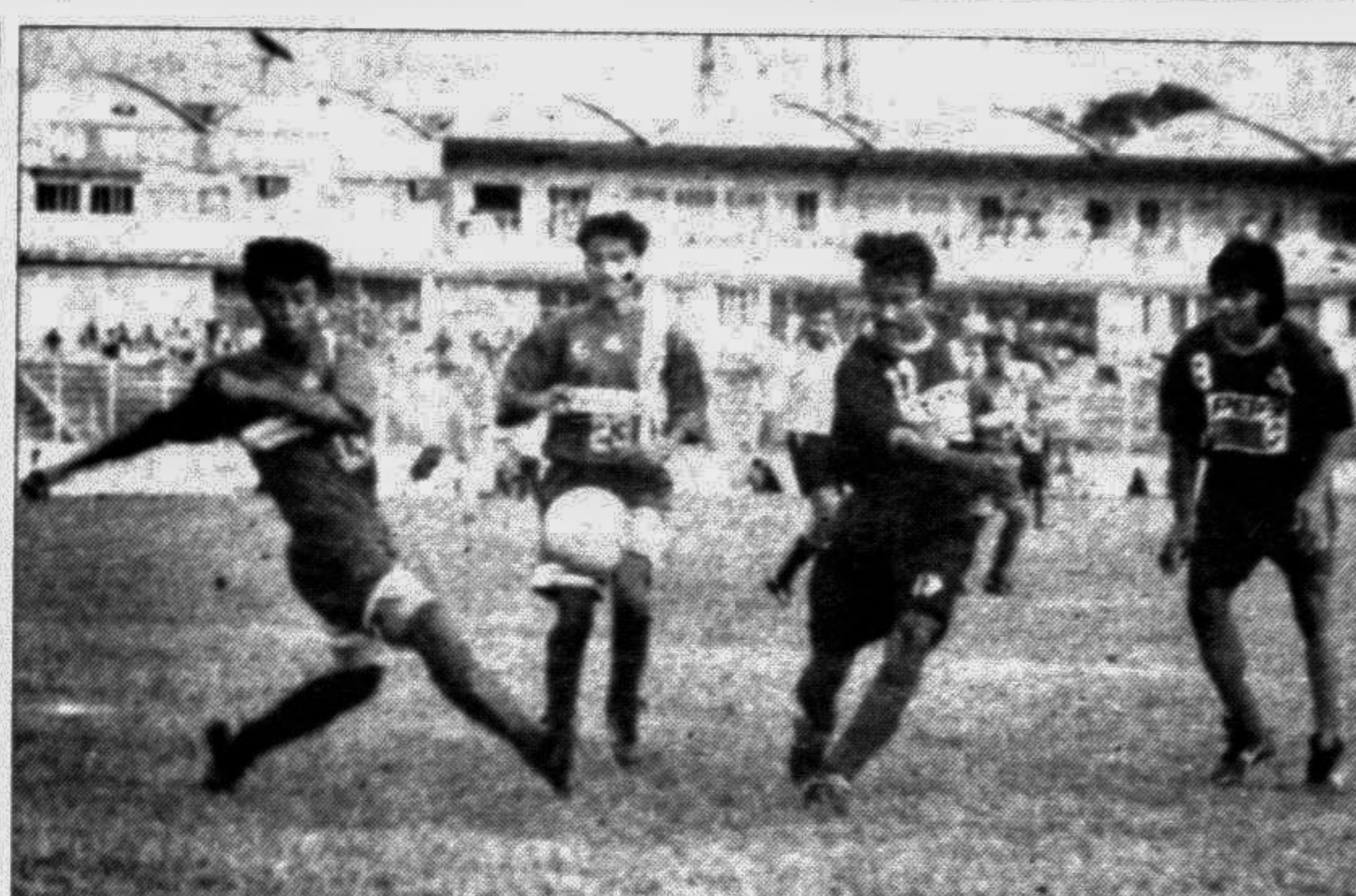
Action from the Danish Premier division football league match between Brothers Union club and East End Club at the Dhaka Stadium yesterday. Brothers Union won 2-0.