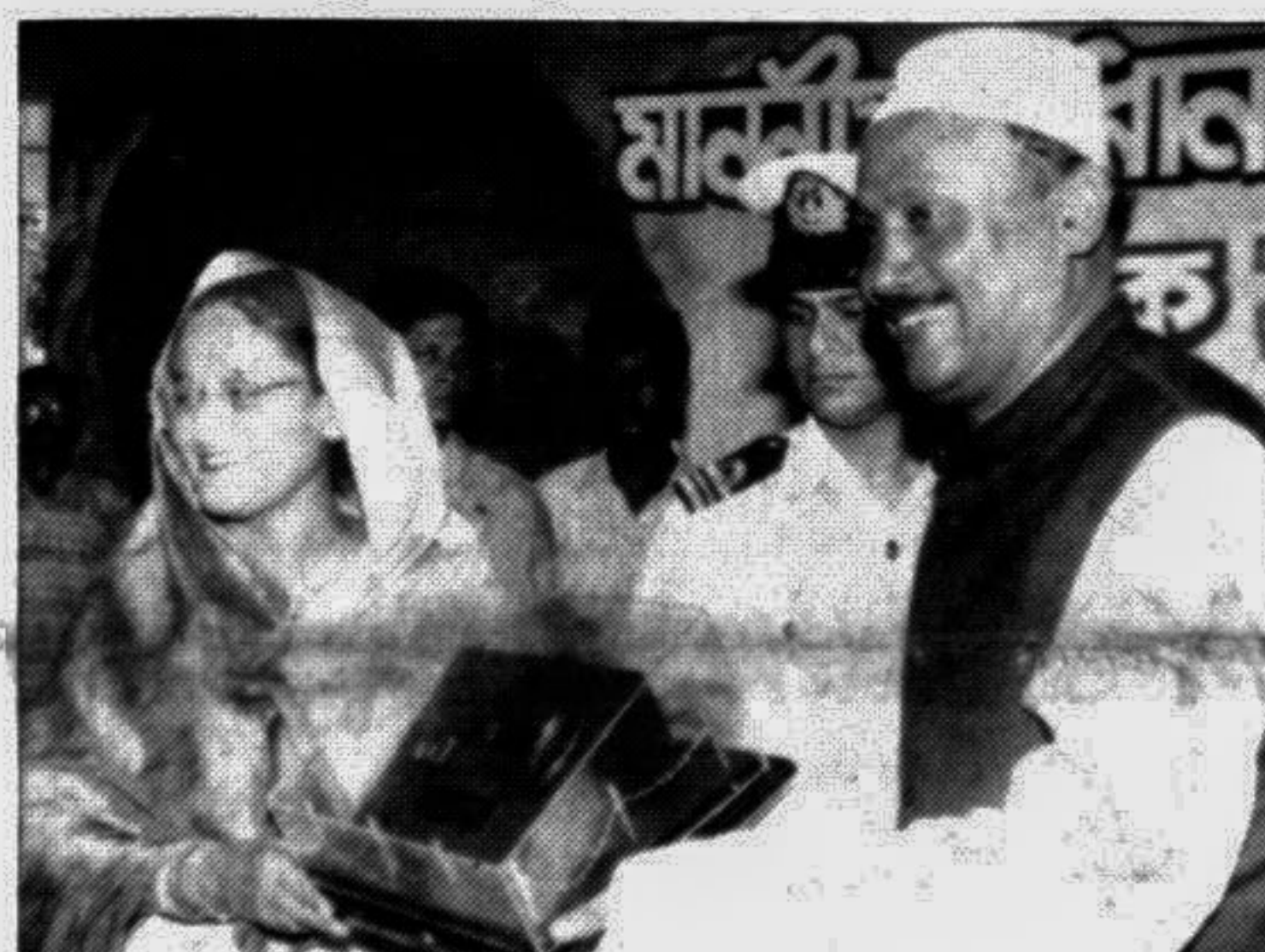
Mayor ABM Mohiuddin Chowdhury presenting the key of Chittagong city to Prime Minister Sheikh Hasina at a civic reception in Chittagong yesterday.

Referring to loadshedding and frequent power failure, the Prime Minister said the government would be held respon-