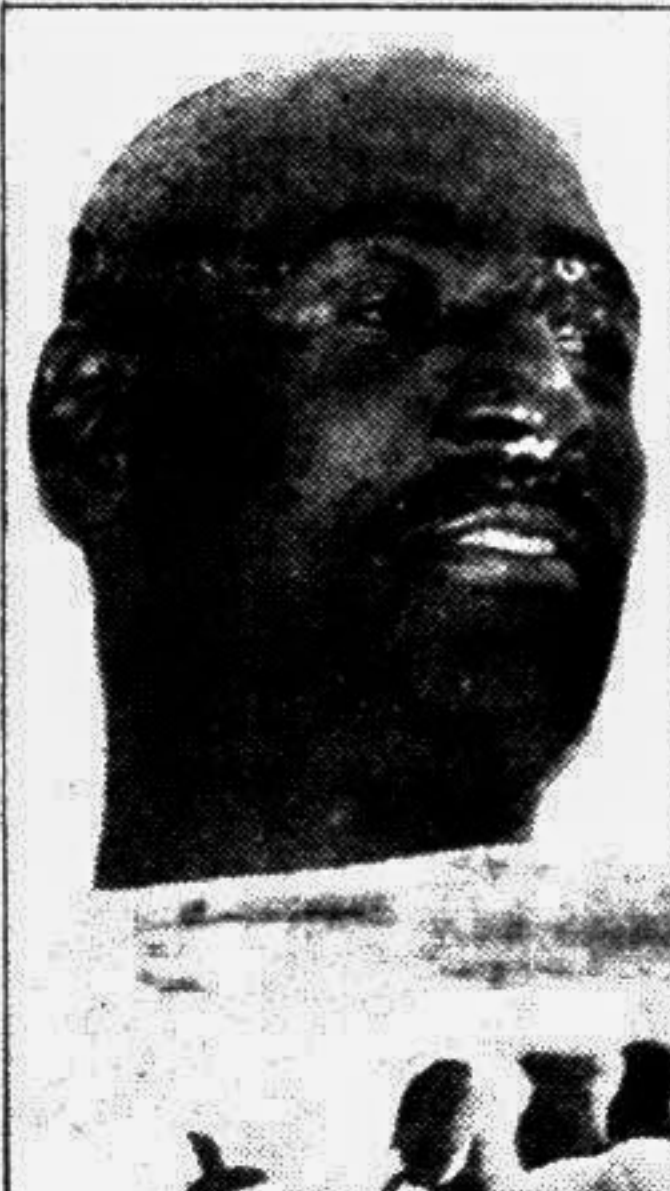
Viv Richards (Former West Indian cricket wizard)