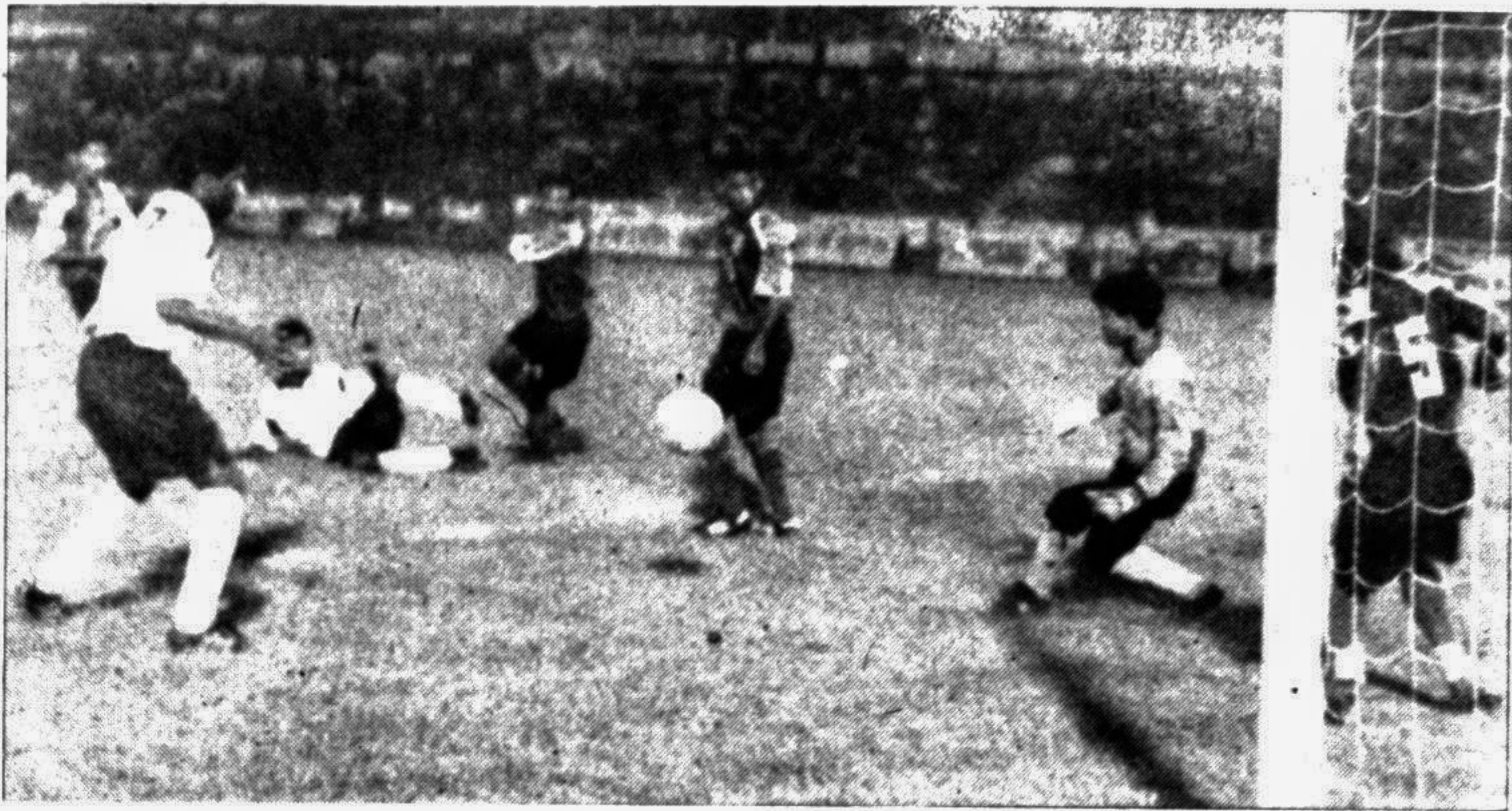
Action from yesterday's Danish Premier football league match between title aspirants Mohammedan Sporting Club and Agrani Bank. Mohammedans recorded a squeaky 3-2 win.

Former Ajax midfielder George Finidi scored on his home debut for Real Betis who recorded an impressive 3-0 win over Athletic Bilbao, while First Division newcomers Extremadura scored their first goal ever in the top flight, only to go down 2-1 at Hercules.