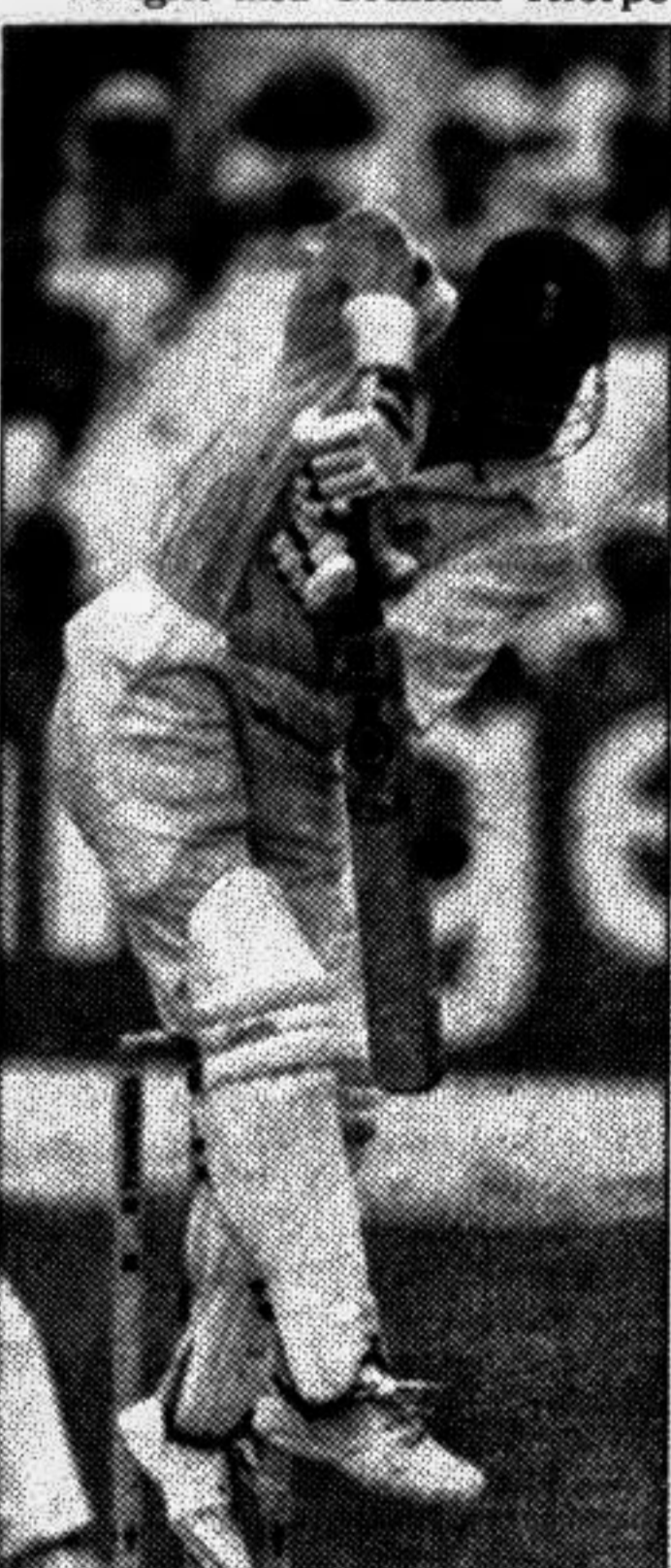
NICK KNIGHT ... 113