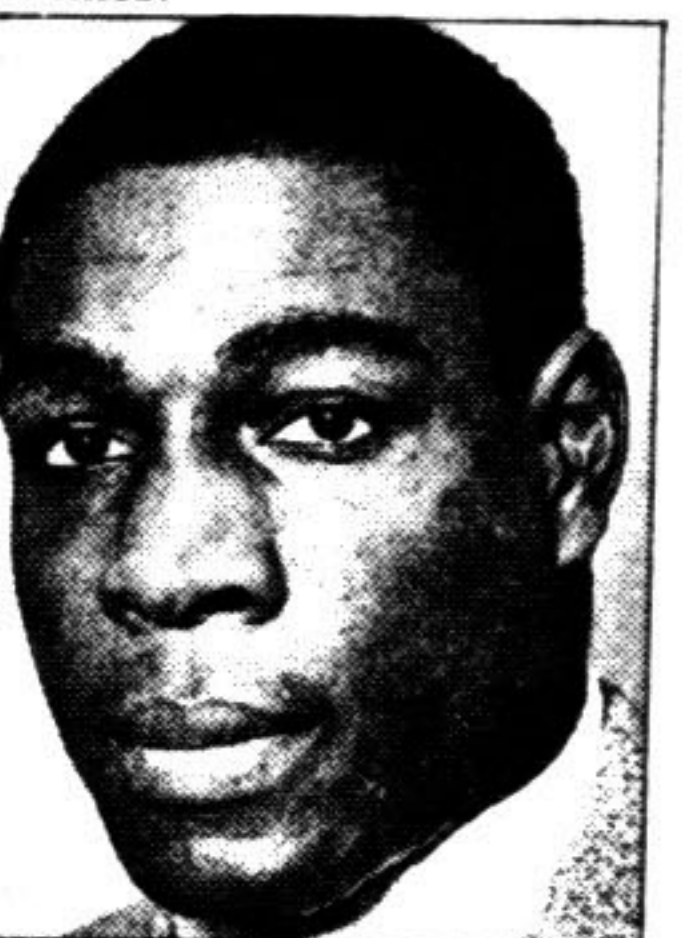
FRANK BRUNO BRUNO AT A GLANCE

Out of the ring, Bruno has parlayed his image as a lovable loser with a Mr. Nice Guy personality into a TV career pitching various products. He also appeared in Christmas stage productions called pantomimes.