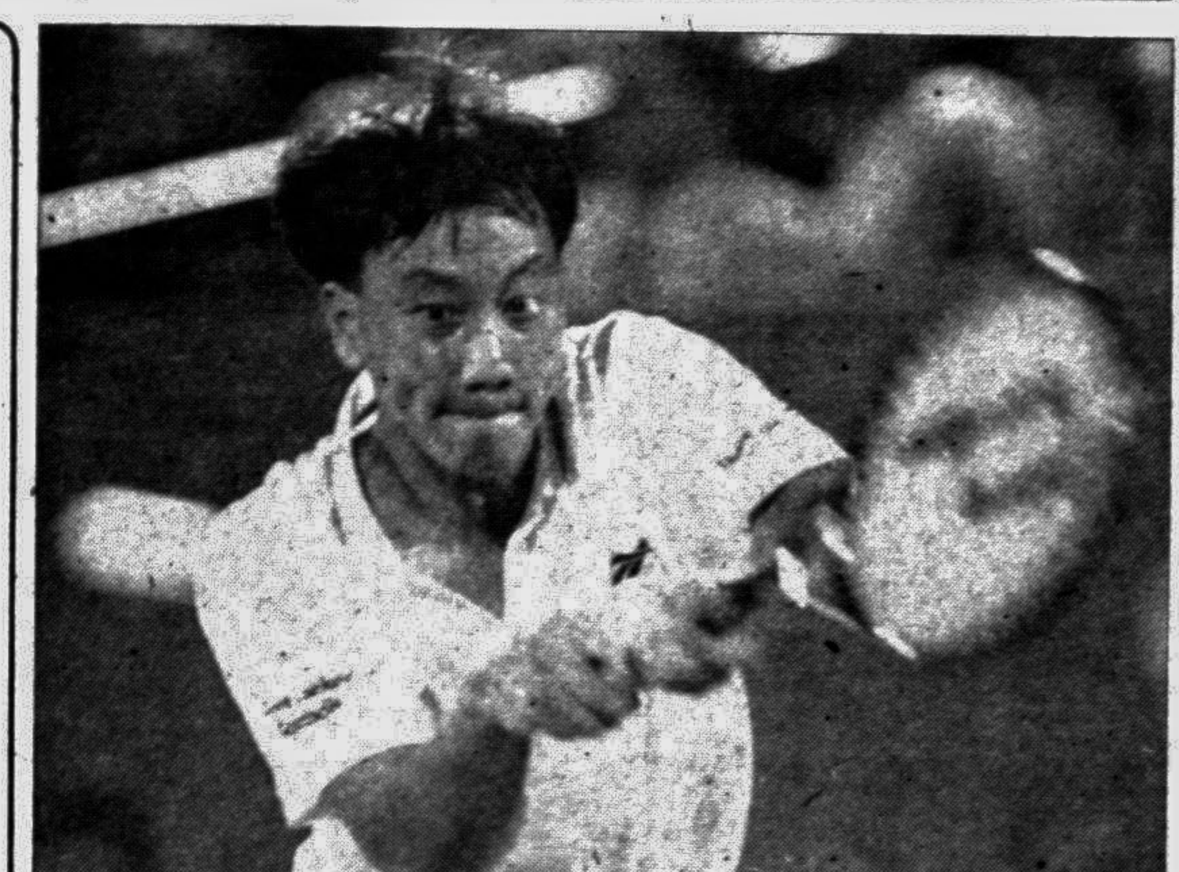
Michael Chang of the US makes a backhand return against South Africa's Neville Godwin in the second round match of the US Open at the Flushing Meadows on Wednesday.

Other notable changes included Argentina's crumbling nine places to 24th and Chile's eight-rung climb to 21st.