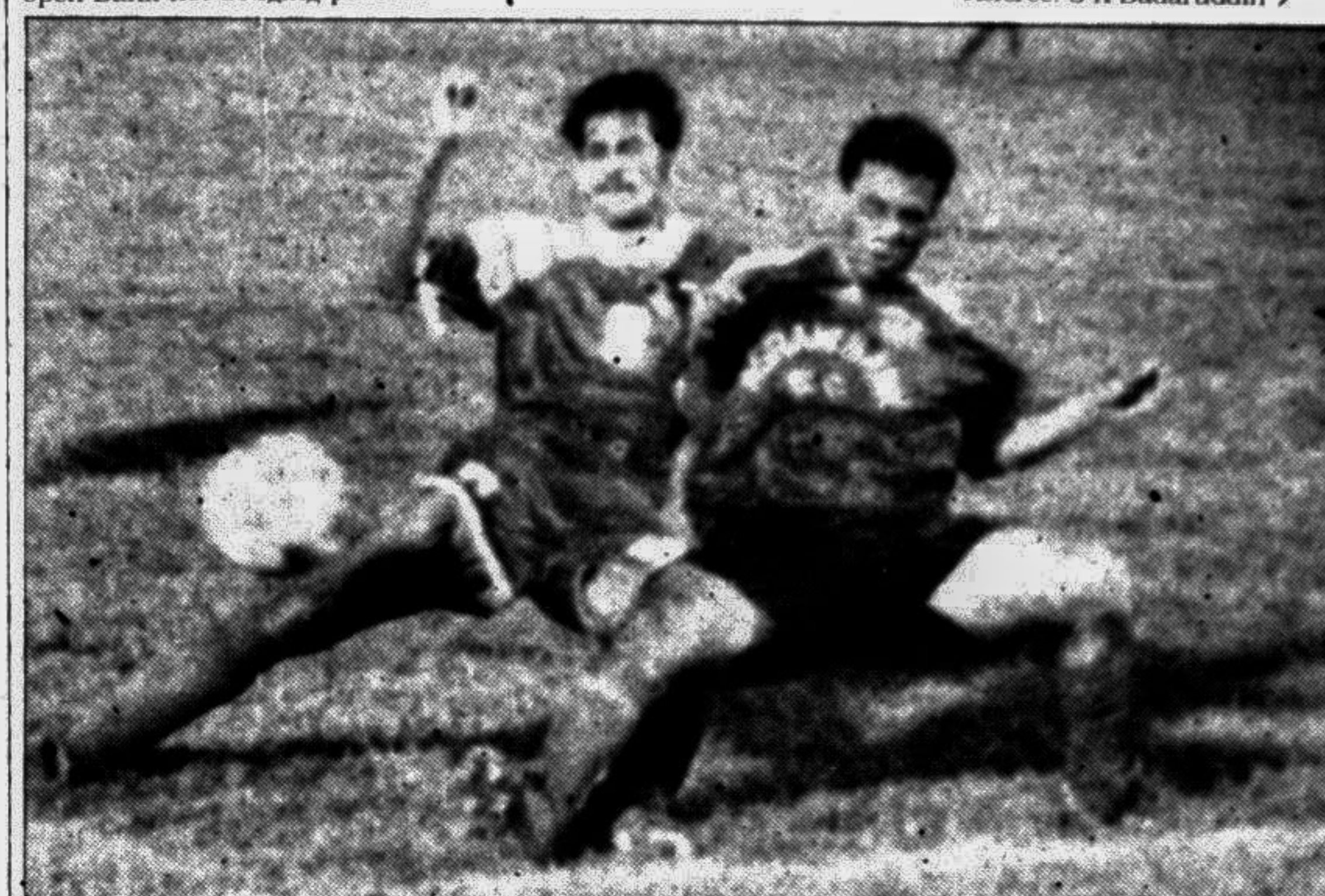
Players of the Muktijoddha Sangsad and Agrani Bank engage in a battle to take control of the ball during their Premier Division football league match at the Dhaka Stadium yesterday.