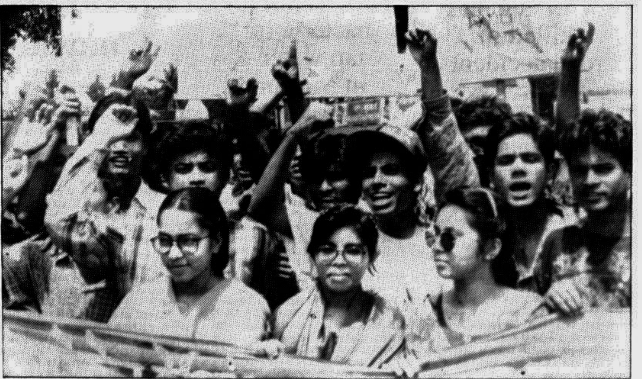
Students of Textile Engineering College brought out a procession in the city yesterday demanding affiliation of the college to Dhaka University.

So far, 313 Bangladeshis have been imparted training on various issues ranging from automotive services to family planning under the technical cooperation programme between the countries.